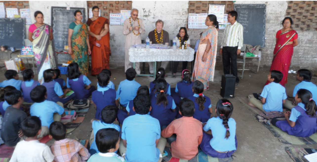
Rajasthan School, India ▼

For further information about the work of the Ethical Trading Initiative, or to see a full version of the Base Code, please visit www.ethicaltrade.org