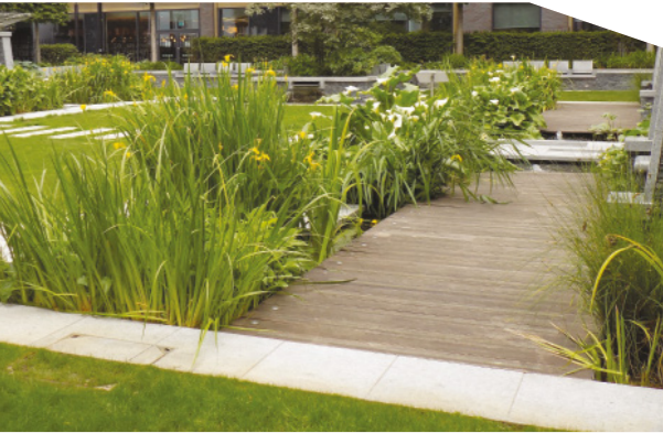
Silver Grey Granite ▼

Our Commercial Team can specify the correct finish, size and material type for your project. Using the right products is crucial to ensure that your landscaped areas can withstand pressures from external forces whilst continuing to look good for many years to come. We will extensively consider various project factors; including traffic levels, pedestrian access, use of delivery vehicles or regular Heavy Goods Vehicles, buses, exposure to weather variations, salting regimes, freeze thaw patterns, surface staining risks from oils, fats, acids or other hard to remove materials, intended cleaning regimes such as jet-washing and usage by skateboarders.