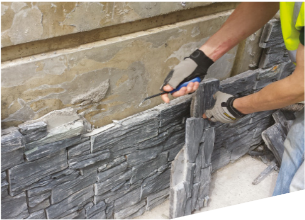
Slate TIER wall cladding system ▼

Our employees have incomparable experience in the industry, with some being with us for over 25 years! We know that learning on the job is key, so if someone’s been working in one of our depots for 10 years then they are going to really know their stuff!