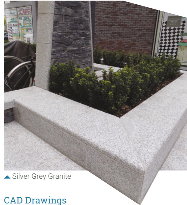
▲ Silver Grey Granite

Our Commercial Team work to fully audited systems that comply with ISO9001 quality procedures on every contract. This puts our customers at the forefront of what the team do and ensures a consistent and professional service from order through to delivery. The aim is always to give our customers the quality of materials they expect, within the time-scales that they expect them. As our Commercial Team has grown over the years, their procedures have developed too – their Quality Manual details the various policies they have in place, covering all the different aspects of a contract from pricing and ordering through to shipping and delivery, as well as working pro actively with customers to resolve any problems in a fair and efficient manner. They regularly conduct their own internal audits and are audited by ISO certification bodies to make sure that they meet the needs of our customers while complying to statutory and regulatory requirements.