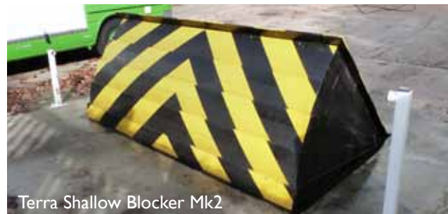
Terra Shallow Blocker Mk2