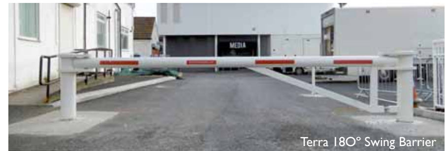
Terra 180° Swing Barrier