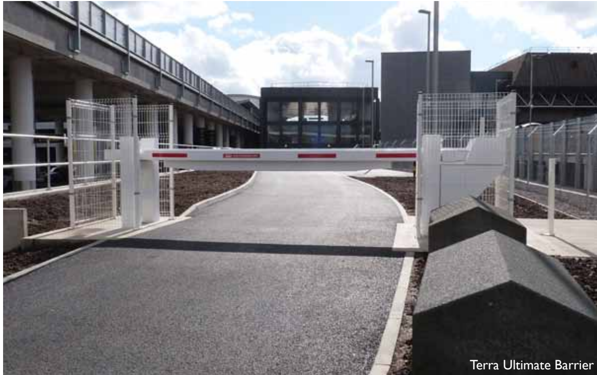
Terra Ultimate Barrier

Compact Terra Barrier, Terra Ultimate Barrier & Terra 180 Swing Barriers