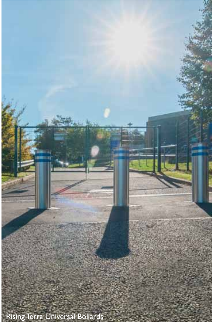
Rising Terra Universal Bollards