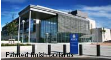
Painted finish bollards