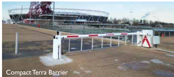
Compact Terra Barrier