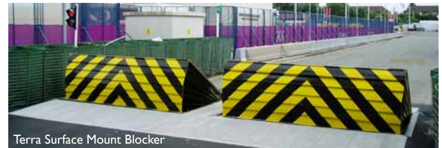
Terra Surface Mount Blocker