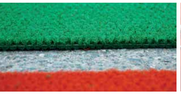
3_In Laid Line