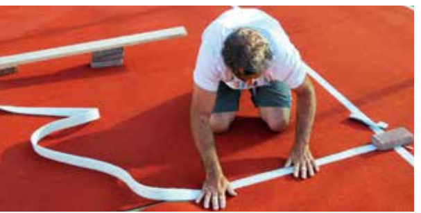
4_In Laid Line