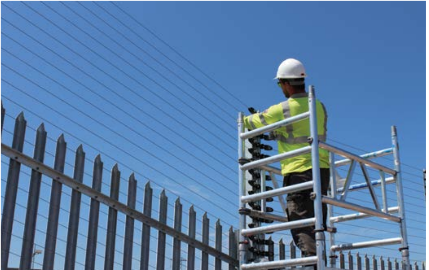
Site Installation by trained and accredited teams