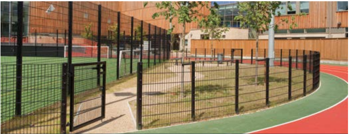
Sports Fencing on new school project

We have more than 100 years of experience in designing, manufacturing and installing high quality fencing and gates throughout the UK. We are able to offer a complete range of products from simple boundary fencing to complex high security perimeter fencing including alarm systems, electric fence and all or types of manual automatic gates. As well as our extensive range of standard products, our in-house design and manufacturing facilities mean we are just as able to supply bespoke steel fencing, railings and gates. Projects we've successfully completed are highly diverse and include those for airports, sports grounds, schools, prisons, data centres, manufacturing plants, distribution centres and retail outlets.