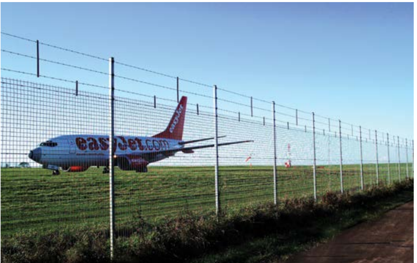
Security Fencing on large airport perimeter