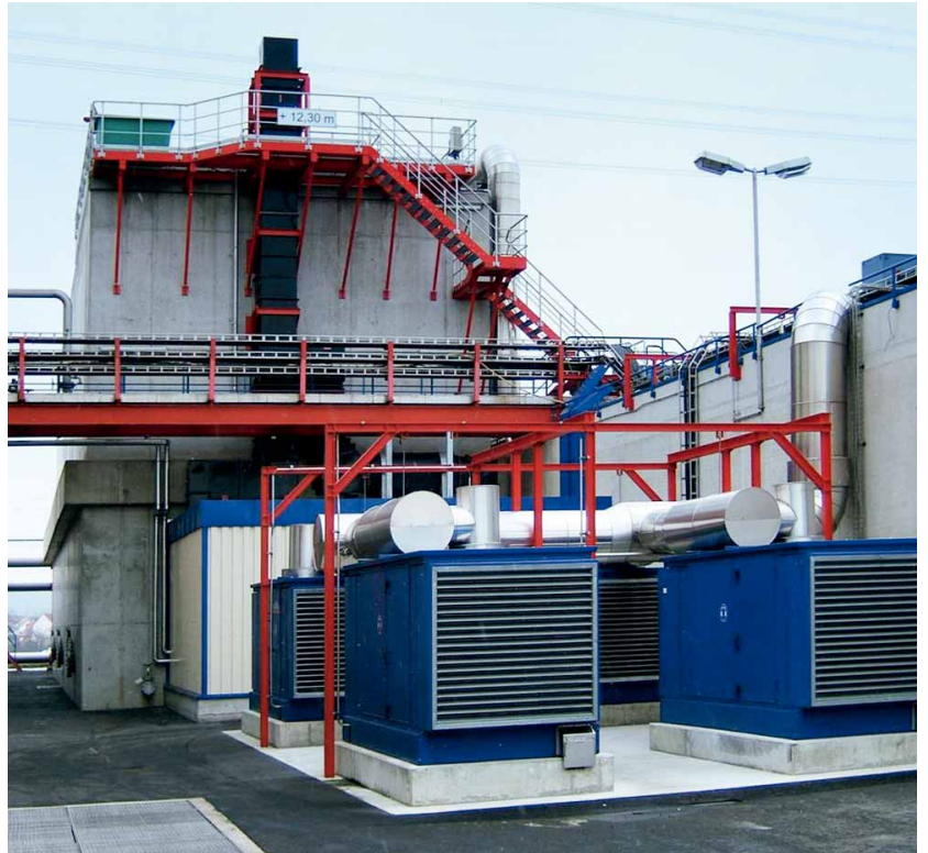
High load floating bed process BIOFIT®.H used in the BIOFIT®.Oxyd 2 process

H+E's BIOFIT®.Oxyd 2 process is the result of more than 20 years' experience in the application of AOP in various wastewater treatment projects.