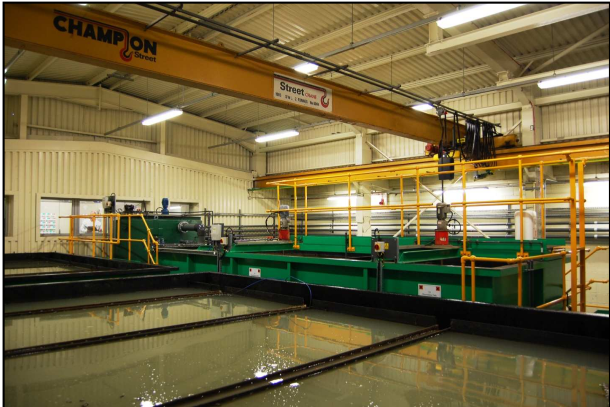
Treatment and Settlement Tanks