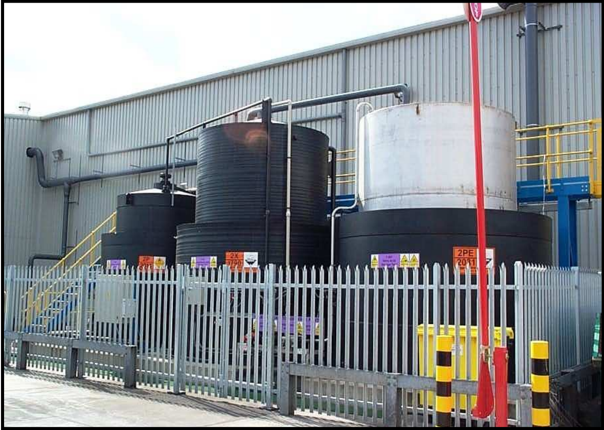
Bulk Pickling Chemicals Storage Facility

More recent upgrades have concentrated more on the continuous drive to reduce operating costs, whether by changes to the pickling chemistry or to water recycling. The success of this part of Outokumpu’s business is a testament to this policy of continuously re-examining the business in detail to determine how operating costs may be driven down by sensible investment in new equipment and systems.