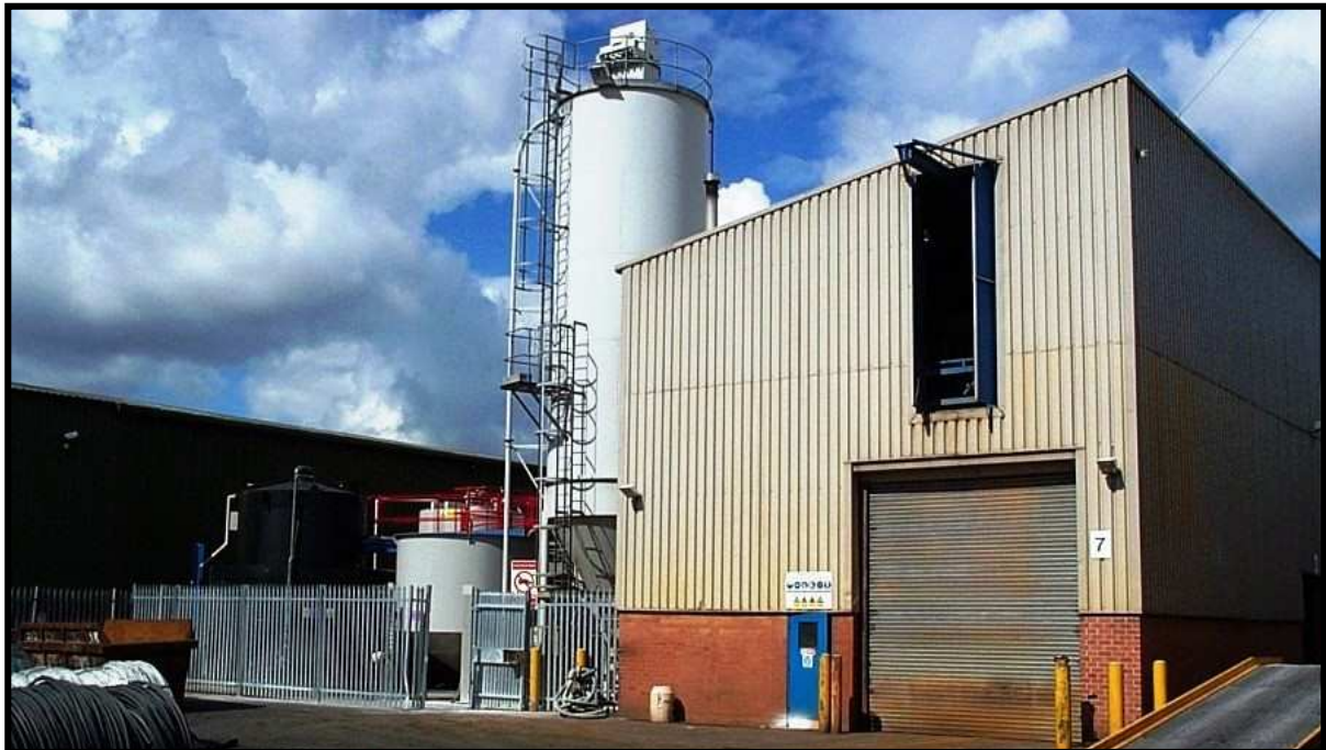
Main Effluent Treatment Plant Building

The pickling project involved a fully automatic immersion process line for handling 1.5 tonne loads of coiled stainless steel wire in a mixture of sulphuric acid, hydrofluoric acid and hydrogen peroxide, together with rinsing and high pressure washing. To serve this plant, bulk chemical storage and dosing systems, fume scrubbing and effluent treatment systems were also included.