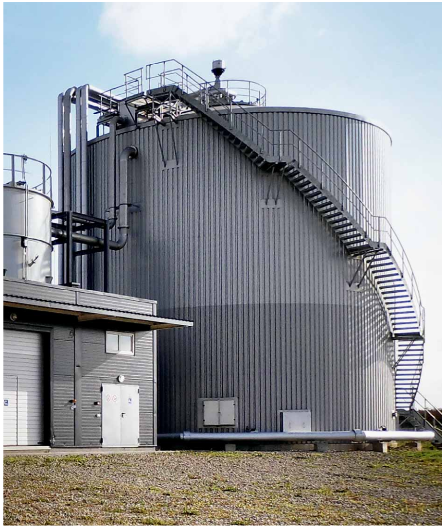
ANAFIT®.CS methane reactor with degassing stage and attached operational building for a HAGER + ELSÄSSER customer in Egypt.

The ANAFIT.CS method is completely unaffected by mineral precipitates, especially calcium carbonate.