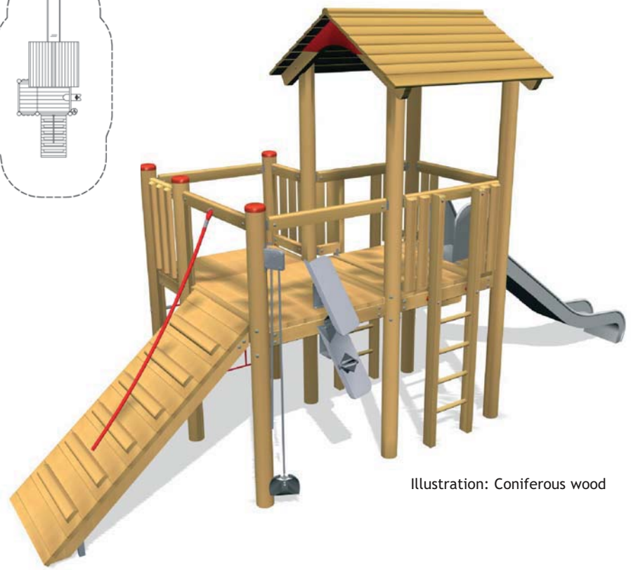
Illustration: Coniferous wood