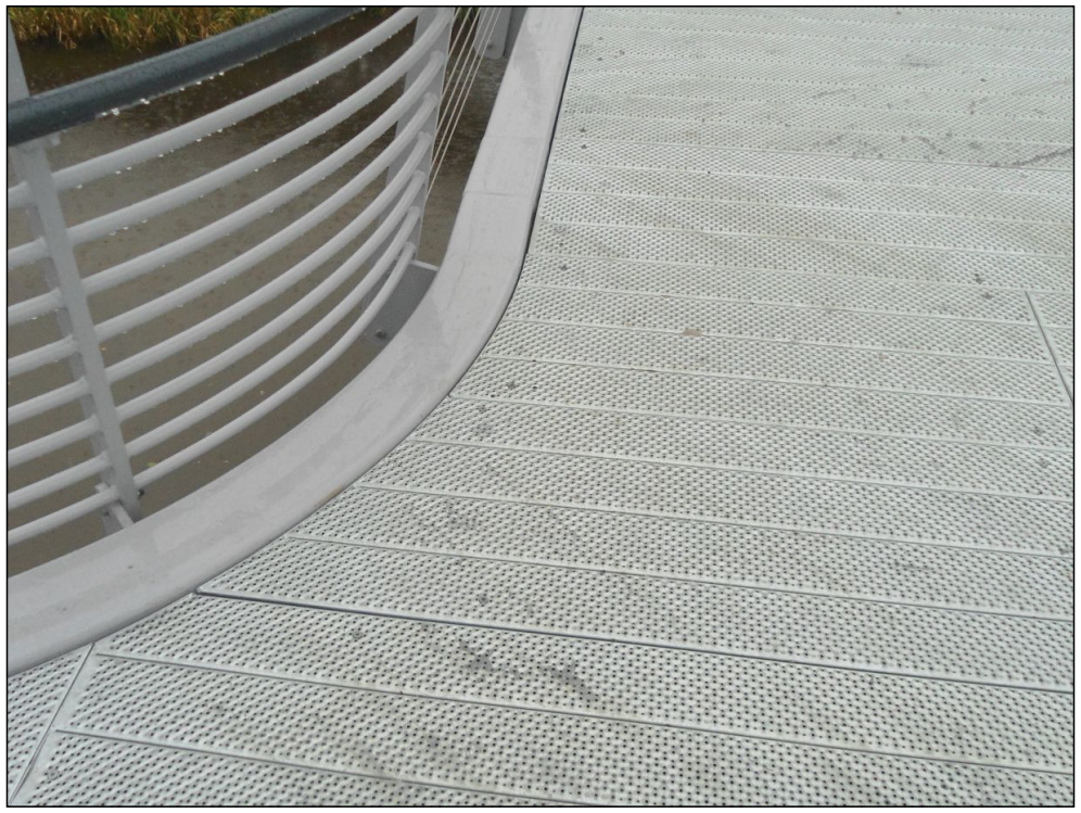
Walkways Type O5 - 150/53+15mm HSS420 (Galvanised)