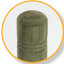
Low Dome High Triple Rout