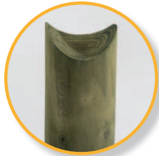
Dragons Tooth Top