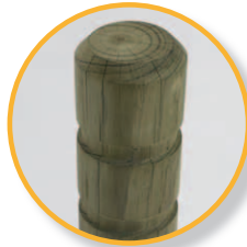
Chamfered, Deep Rout Duo