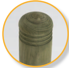
Low Dome Deep Triple Rout