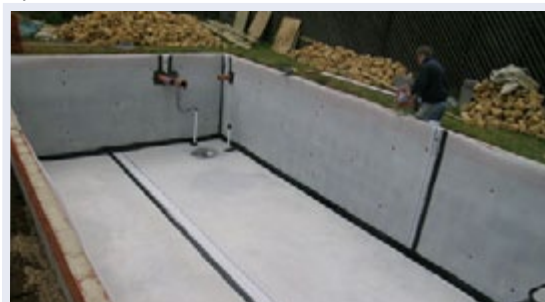
Newton 508 cavity drain membrane was applied to the walls