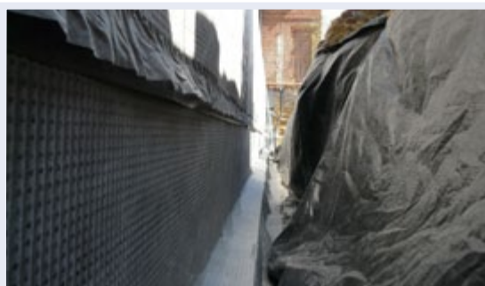
Newton 902 applied prior to Newton 410 Geodrain