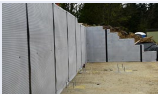
Newton 508 cavity drain membrane was applied to the walls