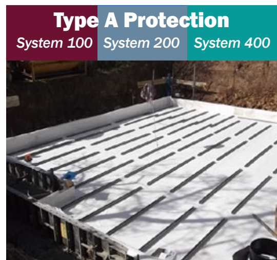
Newton 403 Hydrobond Bonding Membrane for Raft and Wall Waterproofing