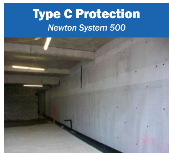
Newton 508 BBA Approved Cavity Drain Membrane

Other waterproofing requirements such as protection at podium decks, pile caps etc. can be successfully waterproofed using Newton waterproofing systems, often using a combination of systems and products.