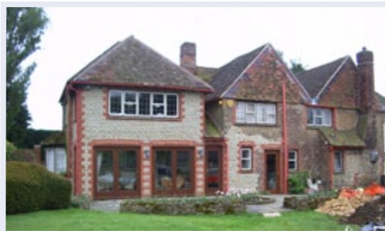
The owners of this stylish property wanted more space and created a new basement

The NSBC installed Newton System 500 with no minimal surface preparation and in a timely manner without the need for extensive drying out times as with other internal tanking systems. The system was installed with service entry points into the drainage channel to enable maintenance of the system - a new design requirement under BS8102:2009.