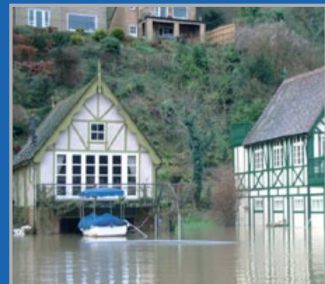
Newton System 500 is installed in this incredible property, it works by redirecting the water rather than attempting to hold it back