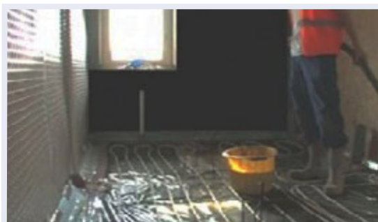
Application of Newton 508 cavity drain membrane to the walls