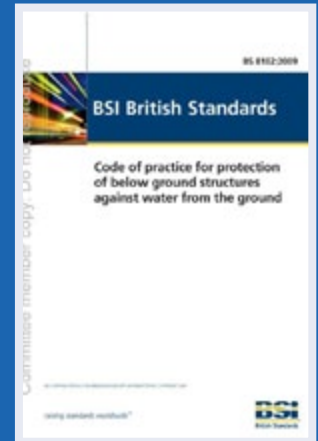
BS8102 'Code of Practice for Protection of Below Ground Structures Against Water From the Ground'

Newton provide waterproofing products for all 3 types of waterproofing defined within BS8102