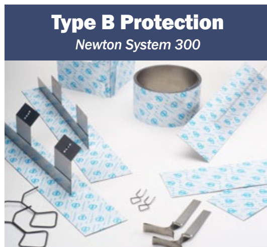
Newton 301 AquaProof, our unique coated metal construction joint water bar