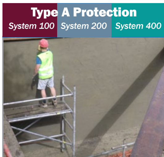
Newton 101F Cementitious Flexible Waterproofing Membrane

Newton 403 HydroBond is pre-applied to the blinding ready for the forming of the concrete raft and the shuttering (permanent or temporary) for the forming of the walls. The product has a fleece inner surface that the wet concrete absorbs into so that when cured, a permanent mechanical bond is formed. This means that if a defect were to occur in the membrane surface, water can only enter at the defect and is unable to move to the joints and so cannot pass into the structure. If the defect happens to be at a joint, water can still not enter the joint due to the solid uPVC waterbar, Newton 310 eFlex , which is also applied to the shuttering or blinding and also fully bonded to the concrete. In addition, Newton 403 HydroBond has a layer of a hydrophilic polymer that swells when in contact with moisture and so will quickly and permanently seal defects in the membrane. The combination of the self healing and bonded properties makes Newton 403 HydroBond a very safe option where Type A membranes are required. Used in conjunction with the Newton System 300 injectable waterbars, it is possible to include design considerations for all of the warnings cited in the previous page within a Type A plus Type B combined waterproofing system.