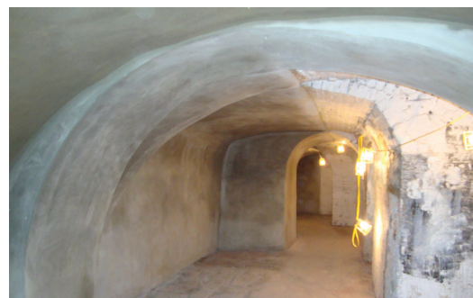
Finished 2 coats of Tarmac whitewall ready for decoration with breathable finish