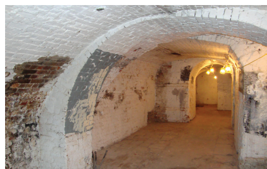
Convoluted damp vaults prior to treatment with the Newton System 500