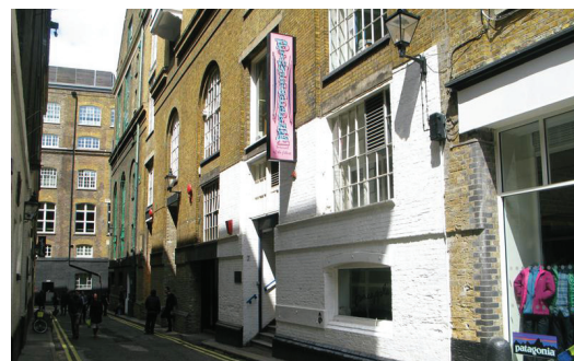
Pineapple Dance Studios was made infamous by the 2011 TV documentary