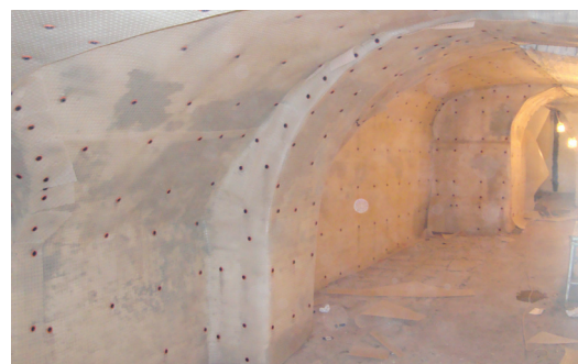
Application of Newton 508 Mesh to the vaulted areas, acting as a barrier against dampness and salts