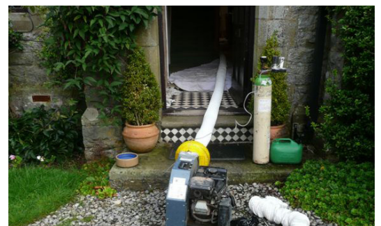
Full testing of Newton PAC System - remarkable results, Radon levels down from 5000 bqm to 100 bqm