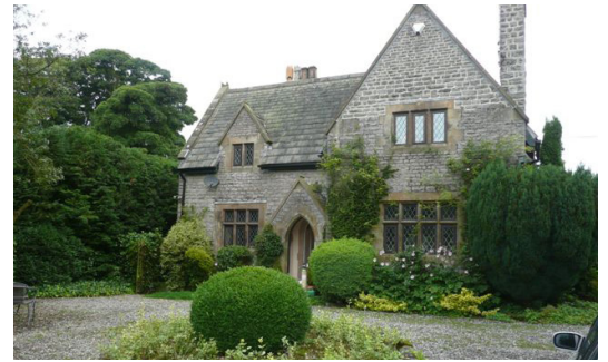
This listed property in Derbyshire is in a high Radon Gas area, so full gas remediation was required.

Gas Remediation Company: Prestige Air Ltd