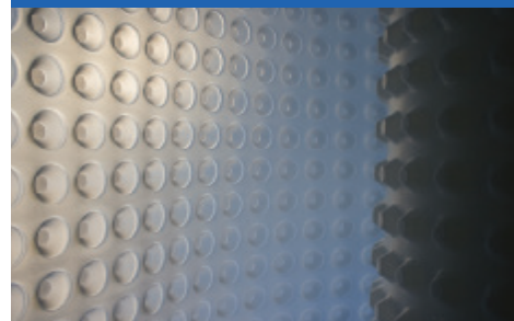
Newton 508 Cavity Drain Membrane