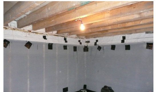
Installation of Newton PAC System, Newton Overtape used to seal around fixings to prevent gas leakage.