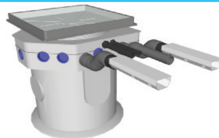
Newton Titan-Pro White