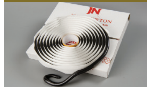
Newton WaterSeal Rope