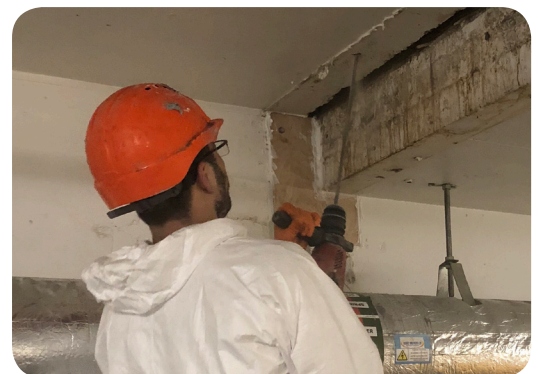
2. Drilling a hole for a 10mm injection packer above the movement joint that needed sealing