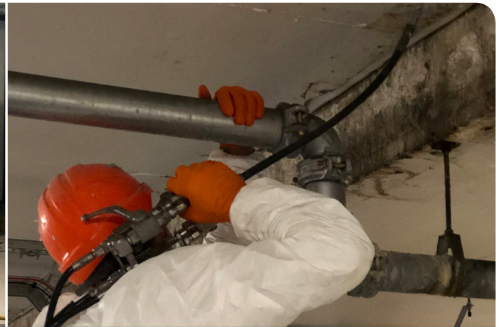
Sealing Movement Joints With Concrete Injection Resin