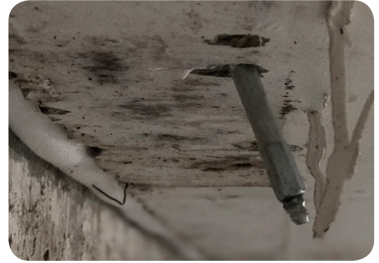
3. The movement joint is filled with a foam backing rod and the packer is inserted behind ready to inject

Newton recommends that our structural waterproofing systems are installed by one of our nationwide network of Newton Specialist Basement Contractors (NSBC) . Trained by Newton, NSBCs offer full professional indemnity on design, and insurance backed guarantees on the installation.