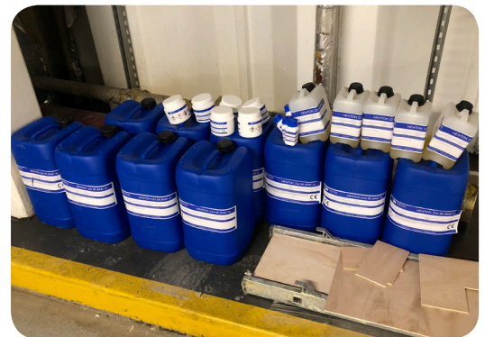
6. Using the Newton 324-SR resin, ASF Waterproofing were able to get the job done quickly and efficiently.