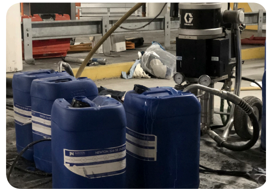
4. Newton 324-SR resin, ready to inject using the two-component stainless steel pump