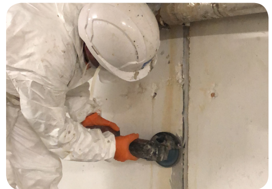
1. Grinding paintwork from concrete to create a good key for the Newton 106 FlexProof

NSBC ASF Waterproofing Client Shopping Centre