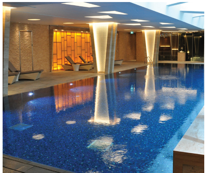
The resident's club houses a luxury subterranean swimming pool.