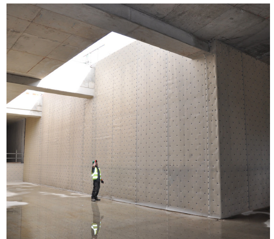
An expansive CDM installation was required.