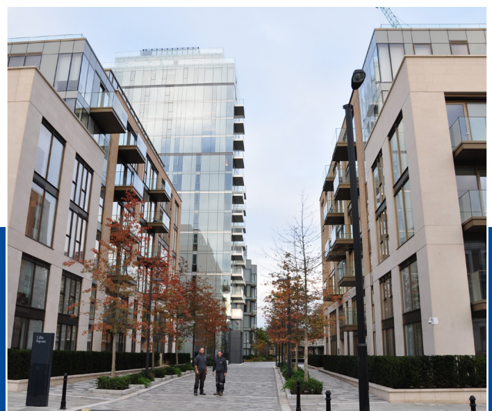
Lillie Square is one of the most prestigious developments in London.