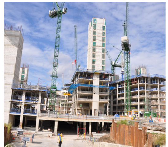
The development is one of the largest in London.

By working with Sir Robert McAlpine at the design stage it was possible to consider the lifetime performance of the structure as well as the cost in order to design and install thorough waterproofing protection.