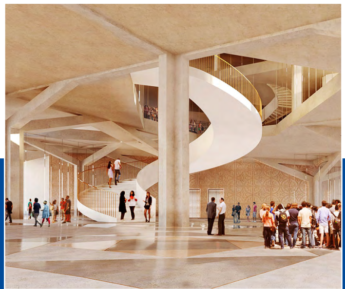
An artists' impression of the Marshall Building's new Great Hall