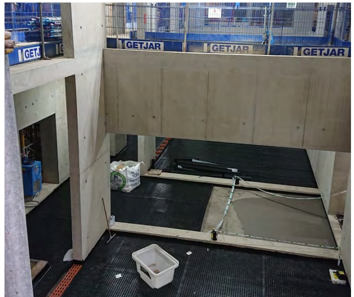
The massive basement spanned across two new storeys.

Applied to concrete surfaces prior to the installation of a Newton CDM System to prevent the 'leaching' of free lime from the concrete, which could block the cavity drain membranes.