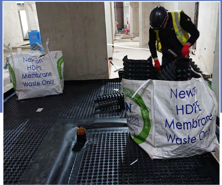
CCL also utilised the unique Newton recycling service.