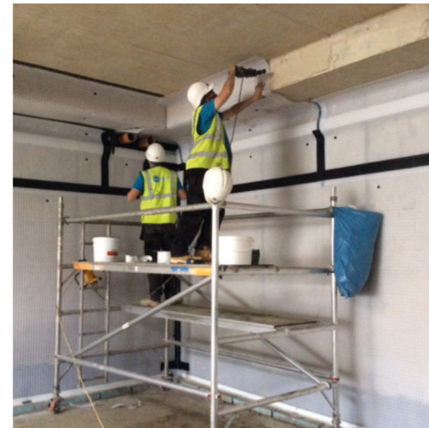
The Newton 508R that forms the air-curtain is neatly fixed to terminate at the soffit

The Newton PAC-500 System has been installed successfully in both new build and refurbishment projects.