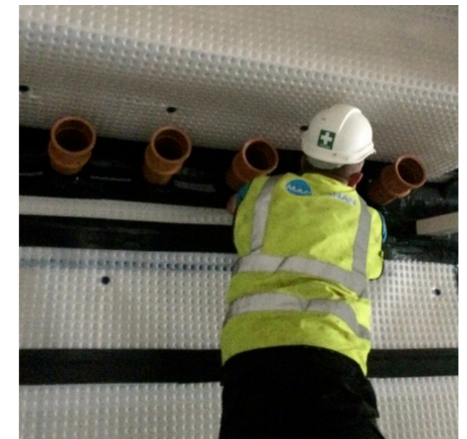
Penetrations through the membrane are carefully 'double sealed' to ensure gas tightness, ready for the trace-gas testing