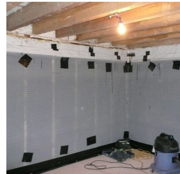
Newton PAC-500 System installed to a house in Derbyshire with very high levels of radon gas

Garry Whittall Contract Supervisor Carter Construction (Gloucester)