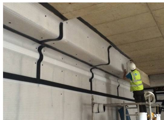
Case Study: Ground Gas Protection and Waterproofing: New-Build Mansion The Newton PAC-500 was the perfect solution for this large-scale new build basement project which included multiple swimming pools.