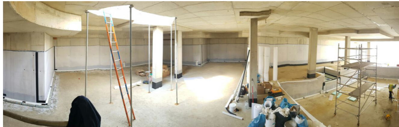
The Newton PAC-500 System is suitable for large and complex, multi-level structures

Where both ground water and ground gases are a potential risk, the Newton PAC-500 System has been developed, tested and proven to work. With any system that utilises a gas barrier, integrity of the barrier is critical, and so the Newton PAC System is tested using a patented trace gas integrity testing method to ensure that the membrane is guaranteed to be fully gas resistant.