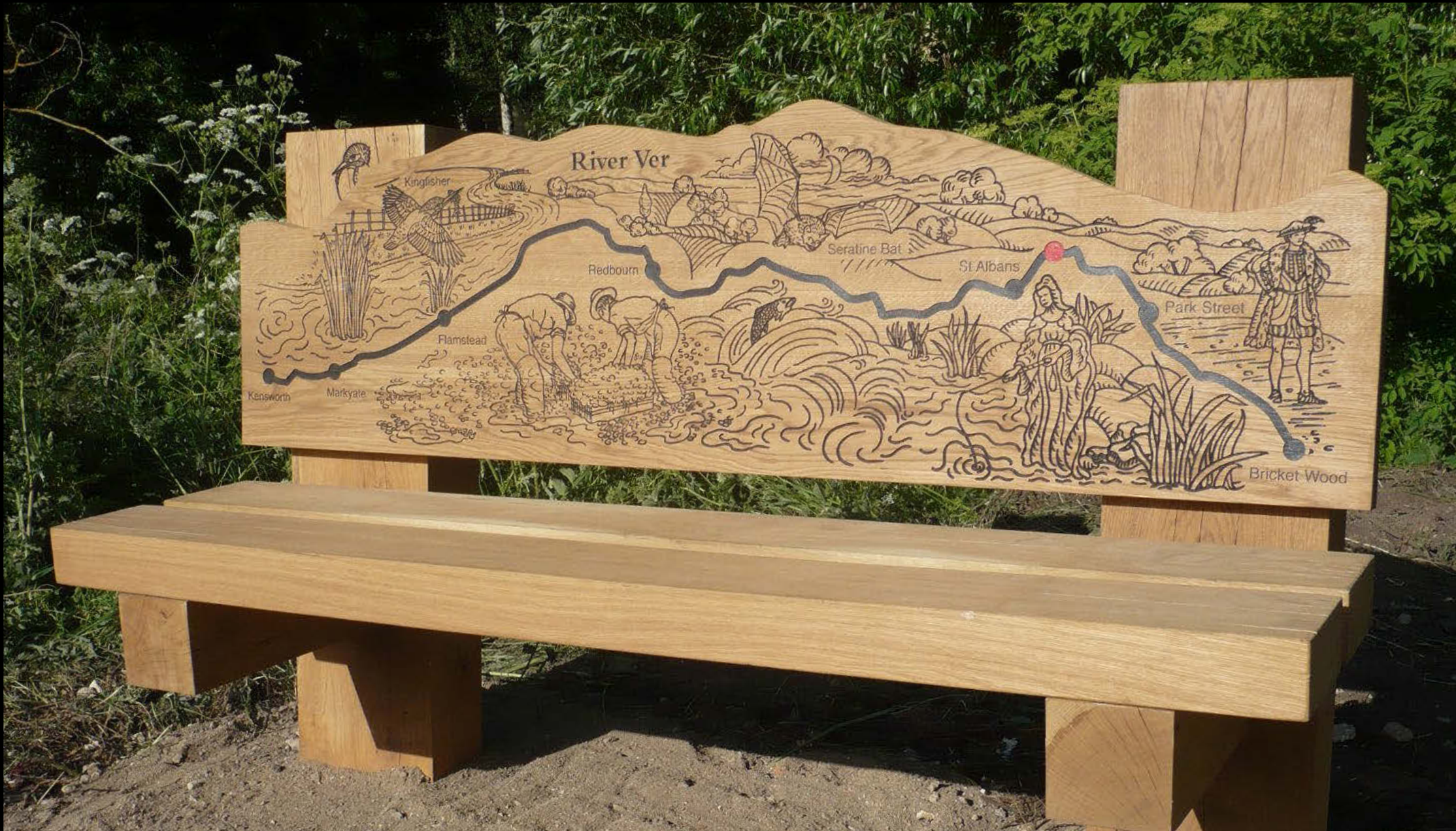
Hertfordshire County Council - Ver Valley