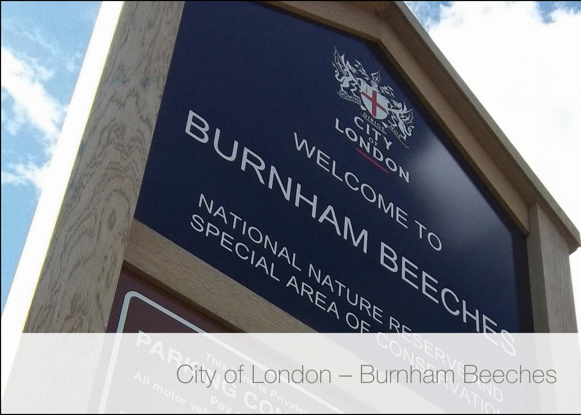
City of London – Burnham Beeches