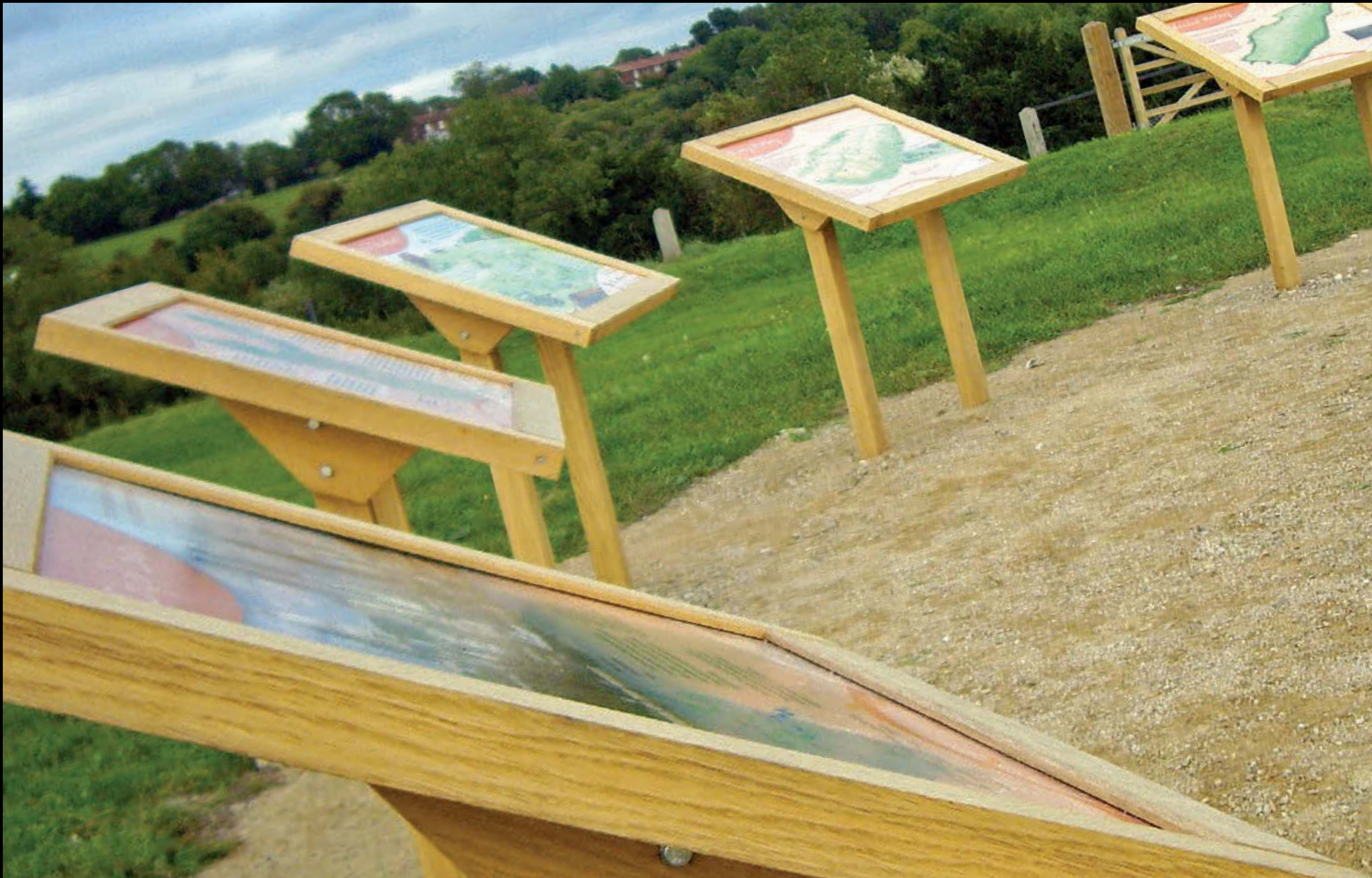
City of London – Farthing Downs