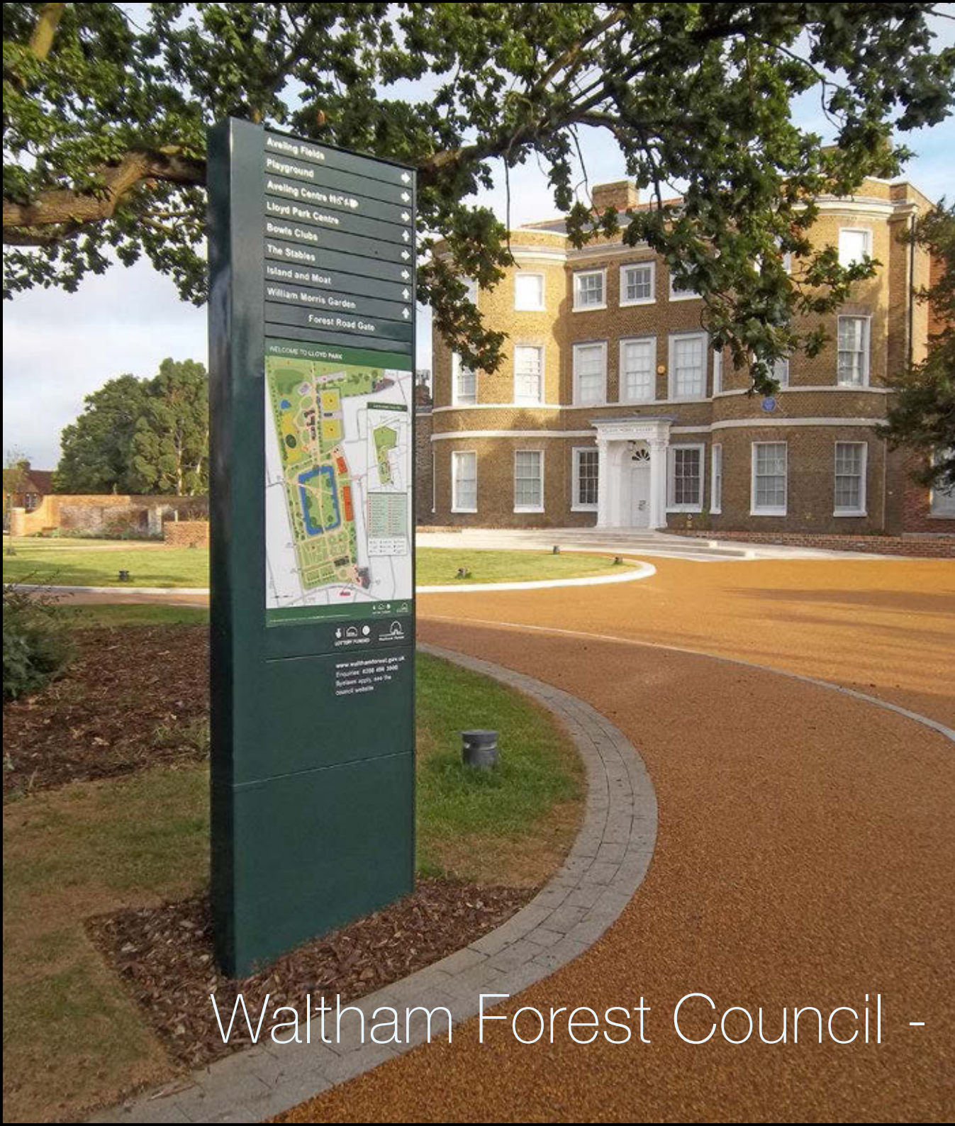
Waltham Forest Council - Lloyd & Aveling Park