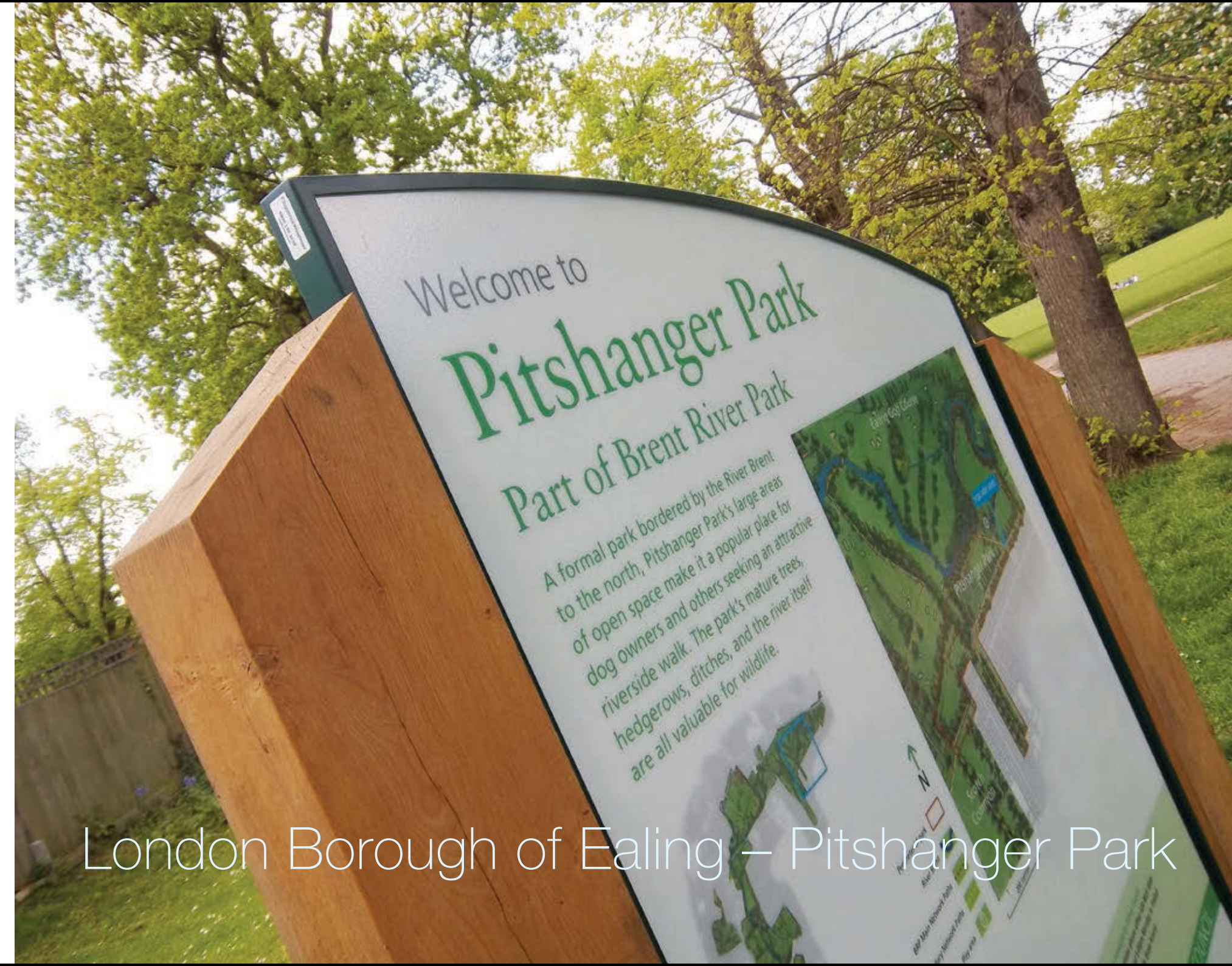
London Borough of Ealing – Pitshanger Park