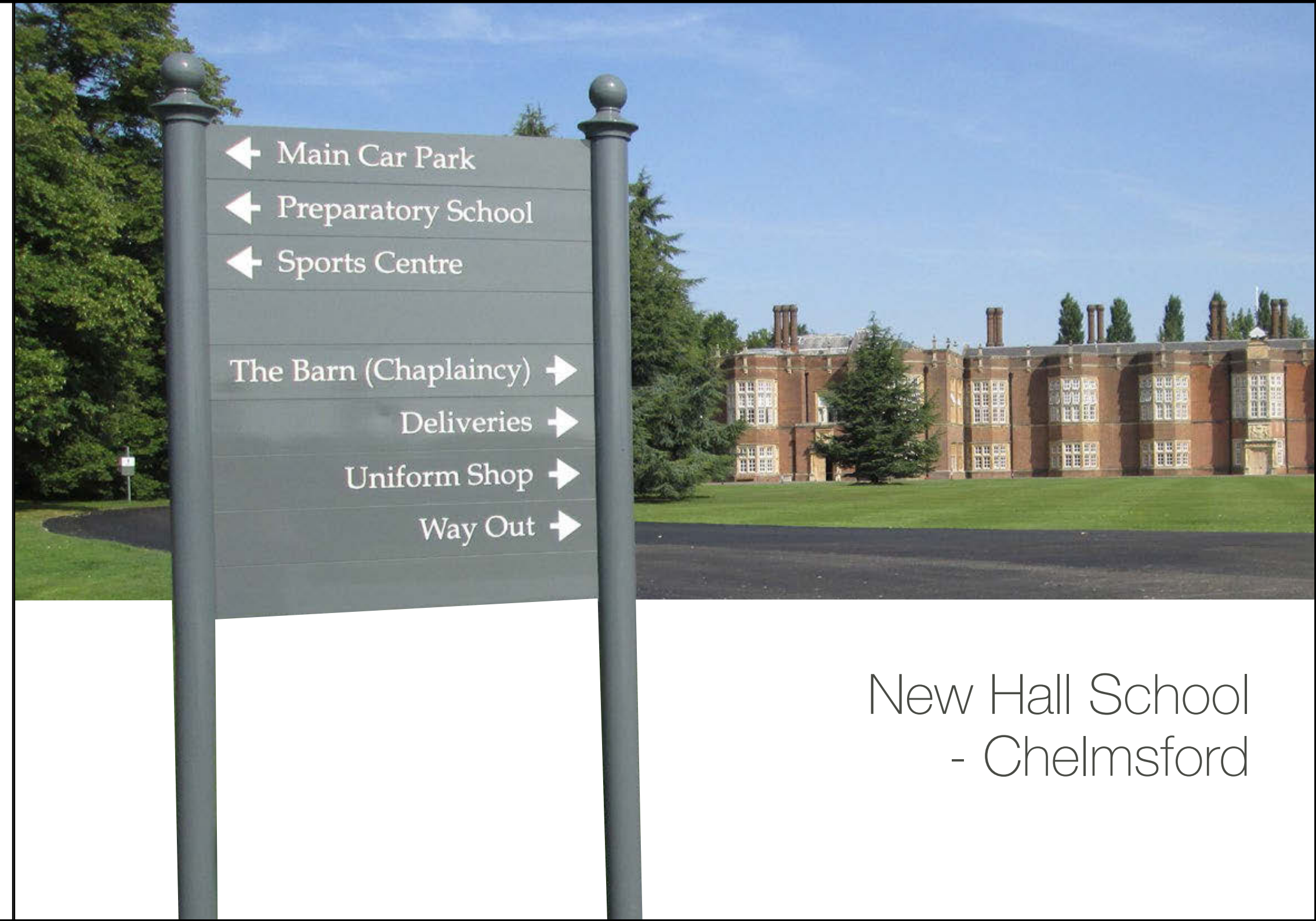
New Hall School - Chelmsford