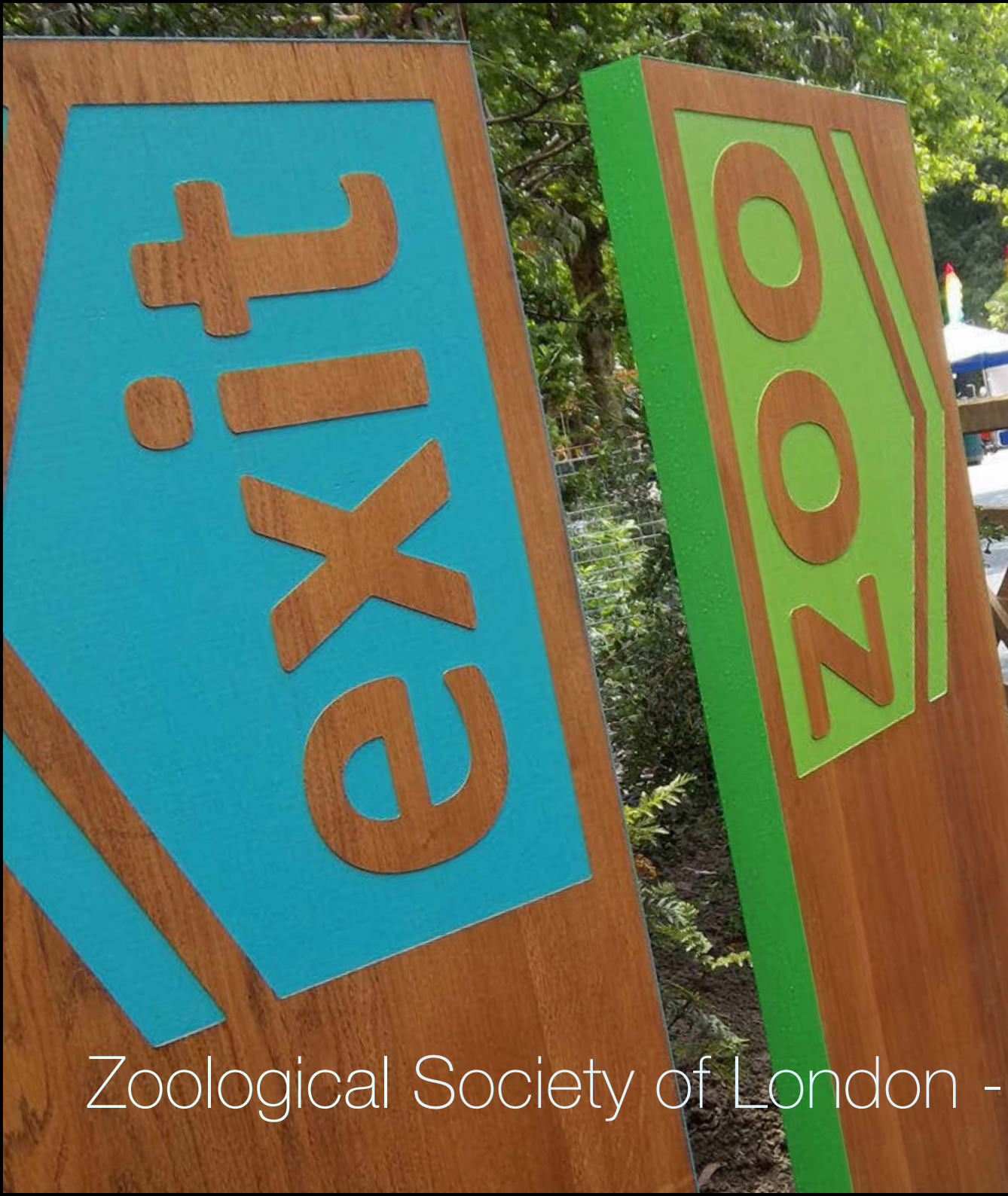
Zoological Society of London - London Zoo