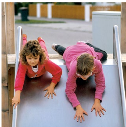
Stainless Steel Slides width 1.00 - 1.50 m