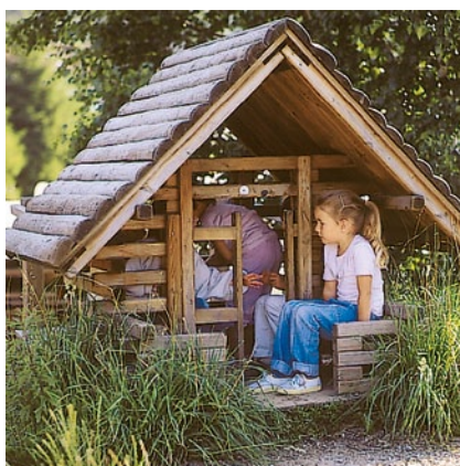
Order No. 4.10110 with door

Small Play House Small Play House with door Big Play House Big Play House with door