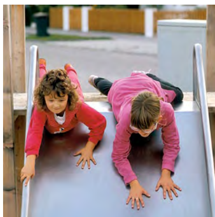
Stainless Steel Slides width 1.00 - 1.50 m