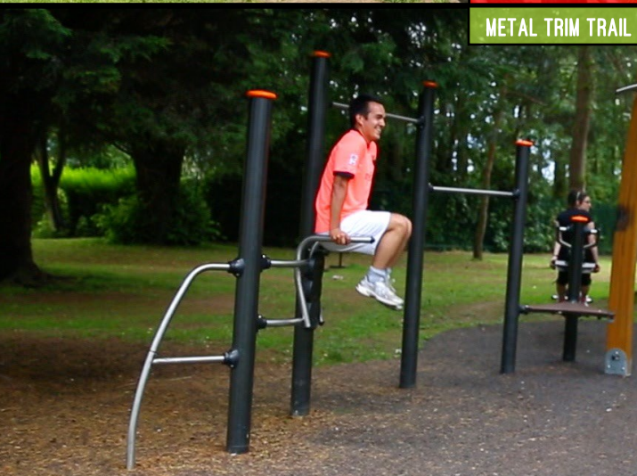
METAL TRIM TRAIL