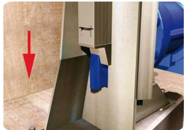
Locking (inside view)