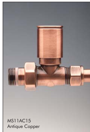
MS11AC15 Antique Copper