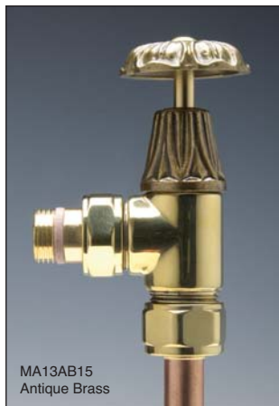
MA13AB15 Antique Brass