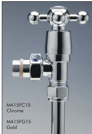
MA15FC15 Chrome MA15FG15 Gold