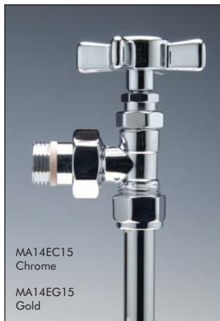
MA14EC15 Chrome MA14EG15 Gold