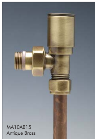
MA10AB15 Antique Brass