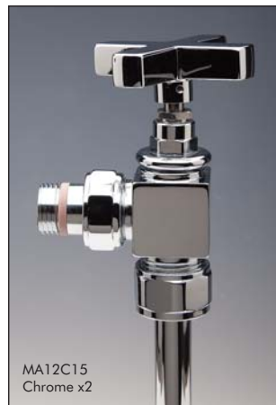
MA12C15 Chrome x2