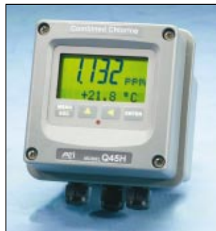
Combined Chlorine Monitor

The Q45H chlorine monitoring system is easy to operate, requires minimal maintenance, and will not eat a hole in your operating budget with on-going reagent requirements or component replacement costs.