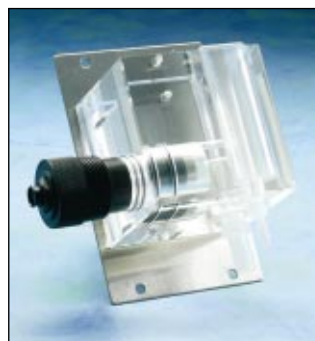
Constant Head Flowcell