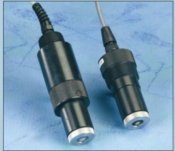
Submersion and Flowcell Sensors

For applications where the second analog output is desired or where alarm relay functions are needed, an AC powered system is available. Operation from AC power allows the user to utilize analog outputs for both chlorine and pH, or for independent PID and chlorine outputs, or simply for chlorine and temperature outputs.