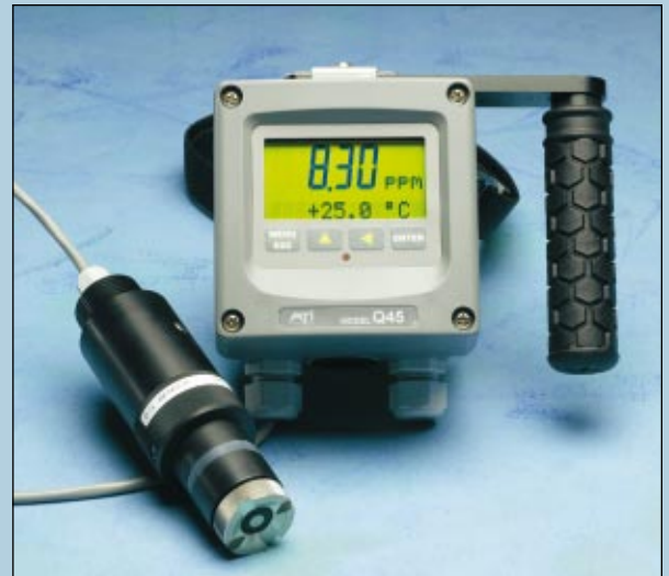
Portable Chlorine Monitor

For even greater versatility, a portable unit powered by a standard 9 V battery is also available. The dual 0-2.5 VDC outputs are assignable to chlorine concentration and temperature. This instrument can be supplied with an internal data-logger, making it ideal for short term monitoring at remote sites. The unit will run for 10 days on a single battery, and the data-logger will store up to 32,000 data points, easily enough for 10 days of data at 1-minute intervals.