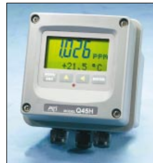
Free Chlorine Monitor