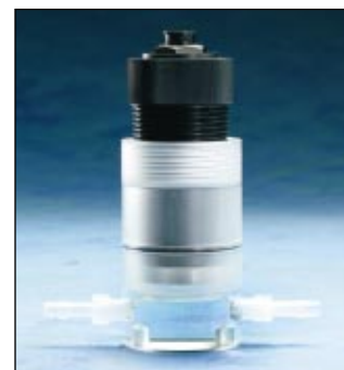
Low Volume Flowcell