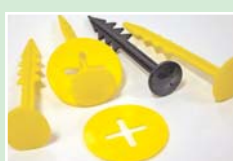
Plastic fixing pegs and parking bay markers / washers