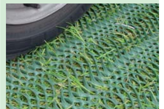
Mesh after installation