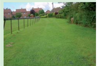
After installation - grass grows through quickly