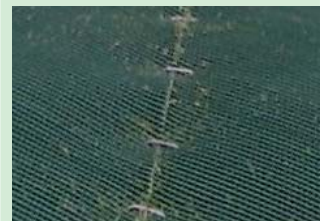
Mesh 'Butt' joined using U-pins