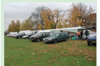
After a few months the grass will be stabilised and can be used