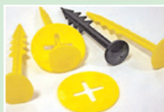
Plastic fixing pegs and parking bay markers / washers