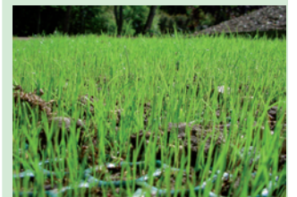
Within weeks the grass grows through the mesh