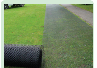
Mesh laid onto existing grassed surface