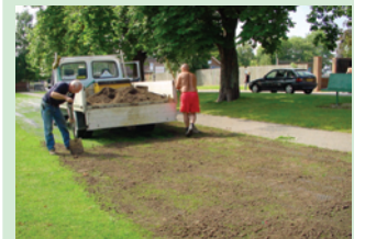
Topsoil brushed over the surface