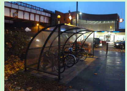
Solent Shelter at Ealing Perivale Station