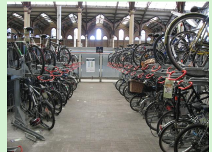
Josta 2-Tier Racks at London Liverpool Street

Cycle-Works was founded to bring high-quality bike parking to the UK. The company installed Britain's first individual bike lockers at Eastleigh in 1996 and Britain's first high capacity two-tier racks at Surbiton in 2004. Cycle-Works has offers a whole range of cycle parking solutions and has installed cycle parking at stations throughout the country. Cycle-Works solutions focus on quality, usability and durability, with customisation options to fit any situation.