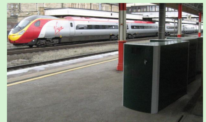
Josta 2-Tier Racks at London Liverpool Street