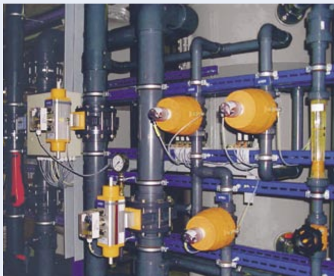
Measurement and Control – Actuated Valves