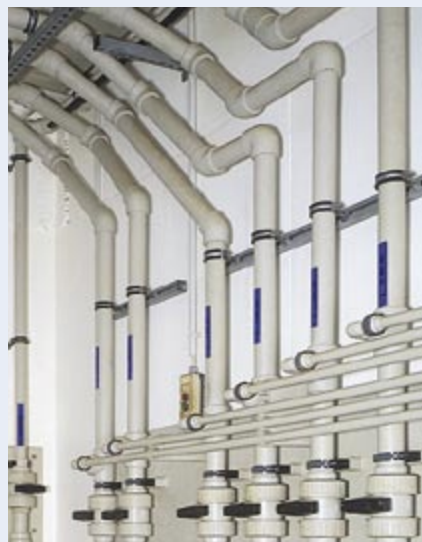
Vacuum – \beta -PP-H, PVC, PE 100