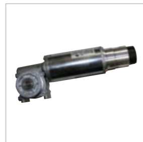
Heavy Duty Motor Gearbox