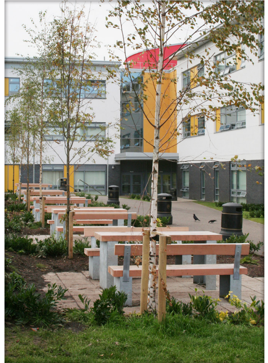
LPT102/C/DF/GL AND LST101/C/DF/GL