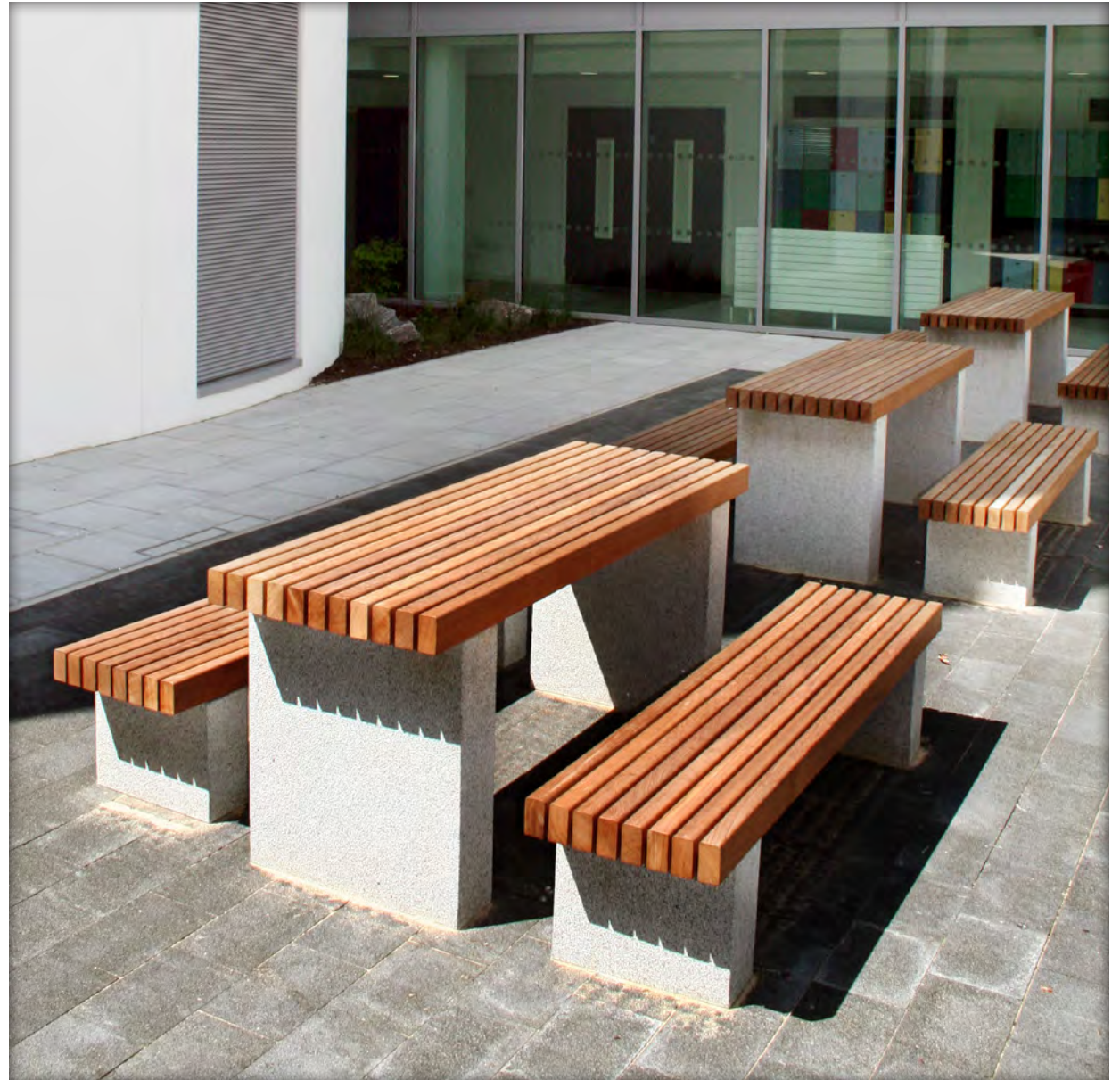
LPT105/D-GG/HI/GL AND LBN114/D-GG/HI/GL