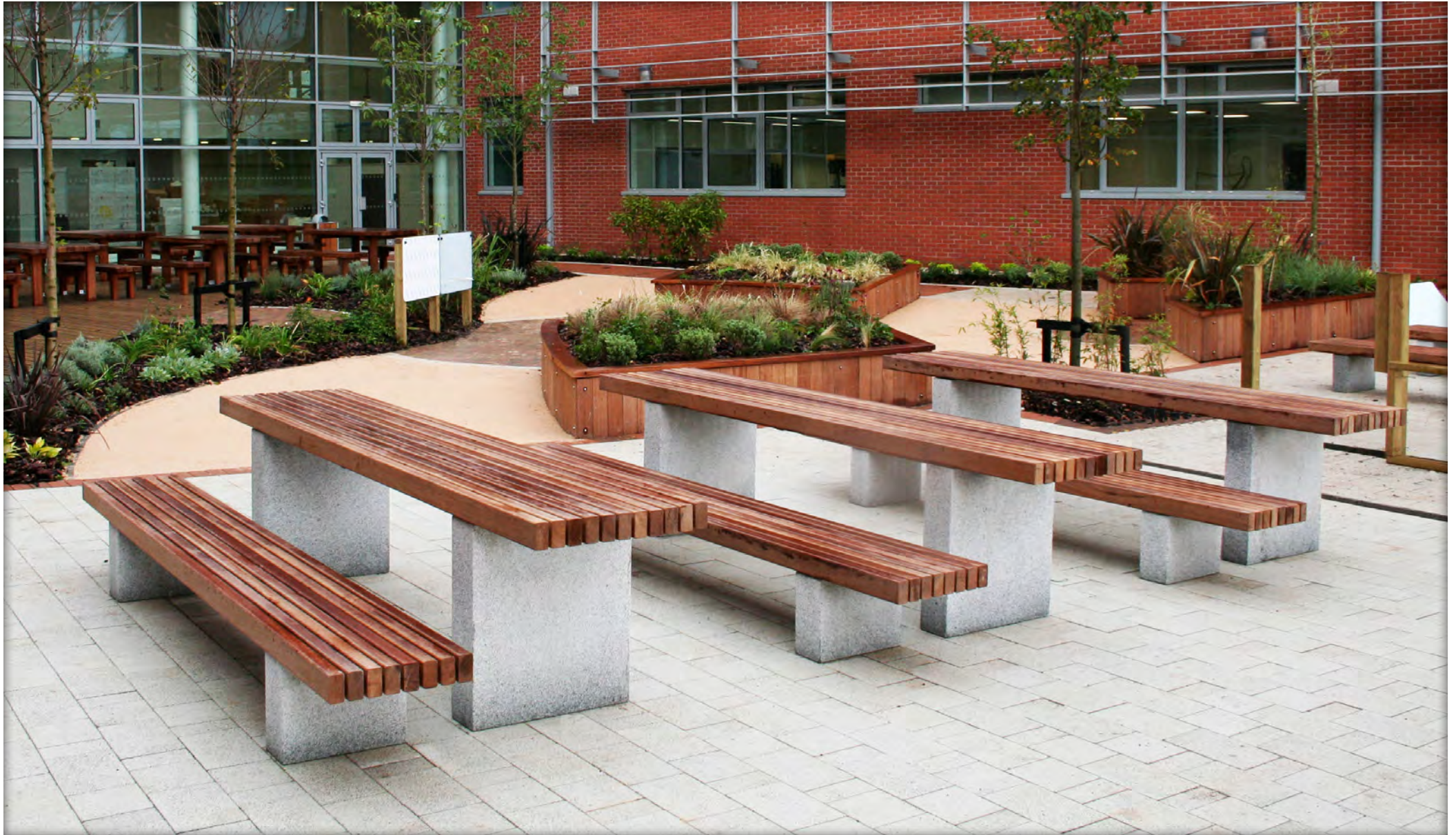
LPT105-3000/D-GG/HI/GL AND LBN114-3000/D-GG/HI/GL