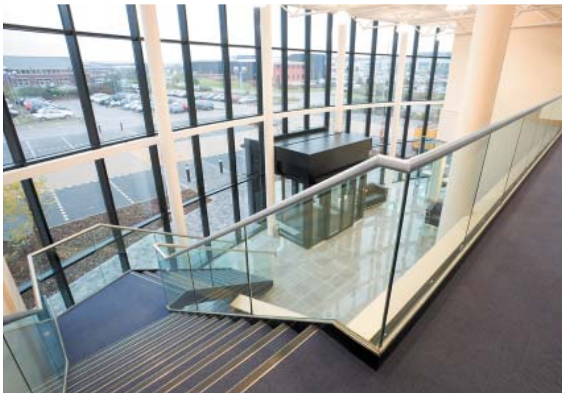
Structural glass infill balustrade with stainless steel top rail.