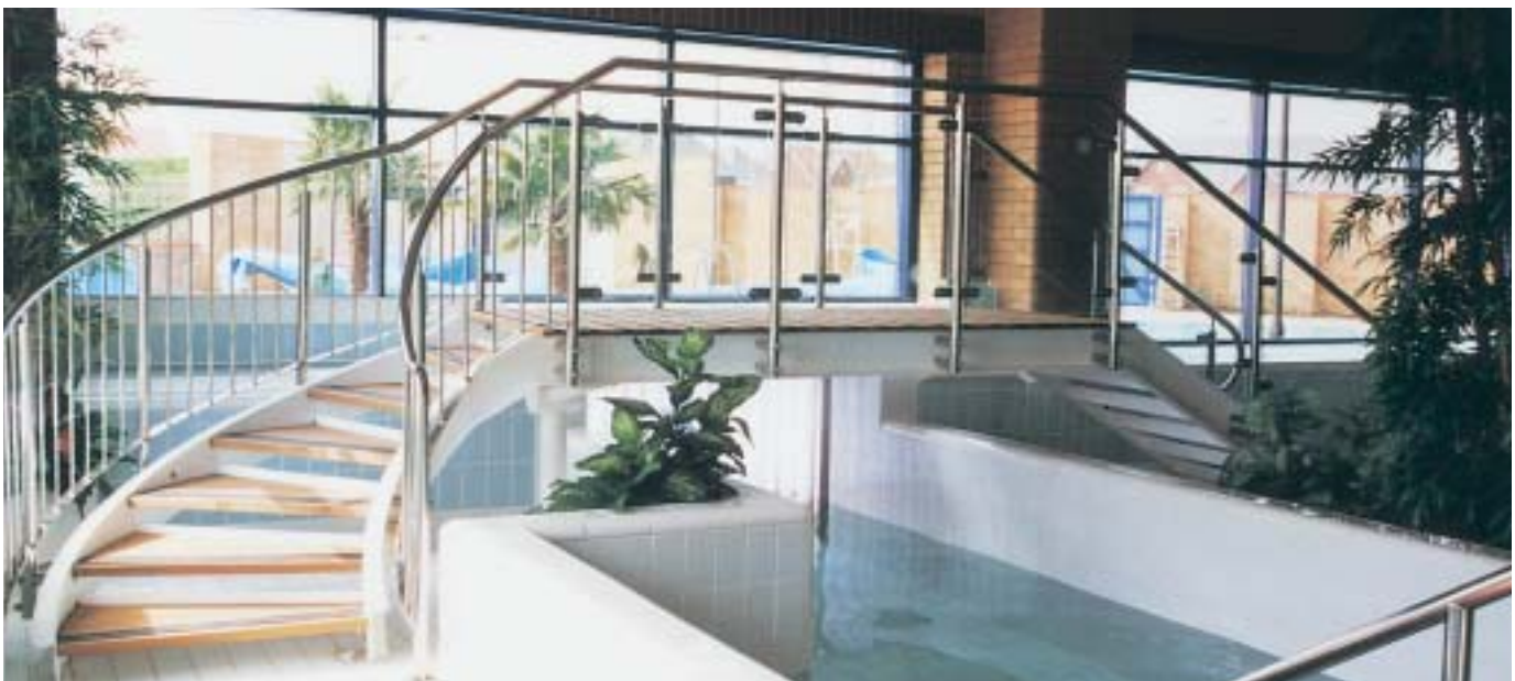
Mild steel bridge, stainless steel balustrading complete with toughened glass and stainless rod infills. Designed by M & G Olympic Products Design & Development Department.