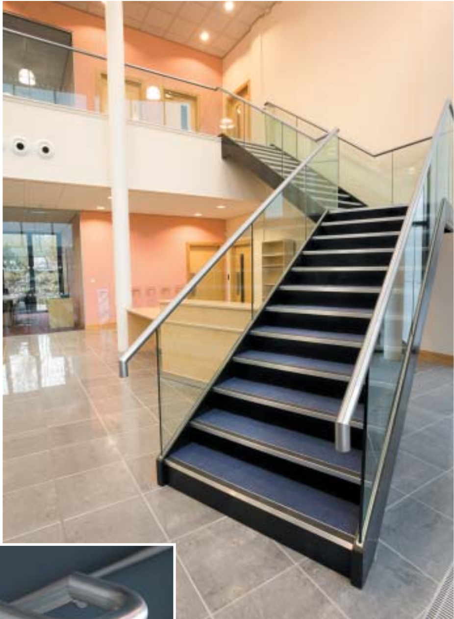
Staircase complete with structural glass balustrading, stainless steel top rail. Project: Pendragon, Nottingham.