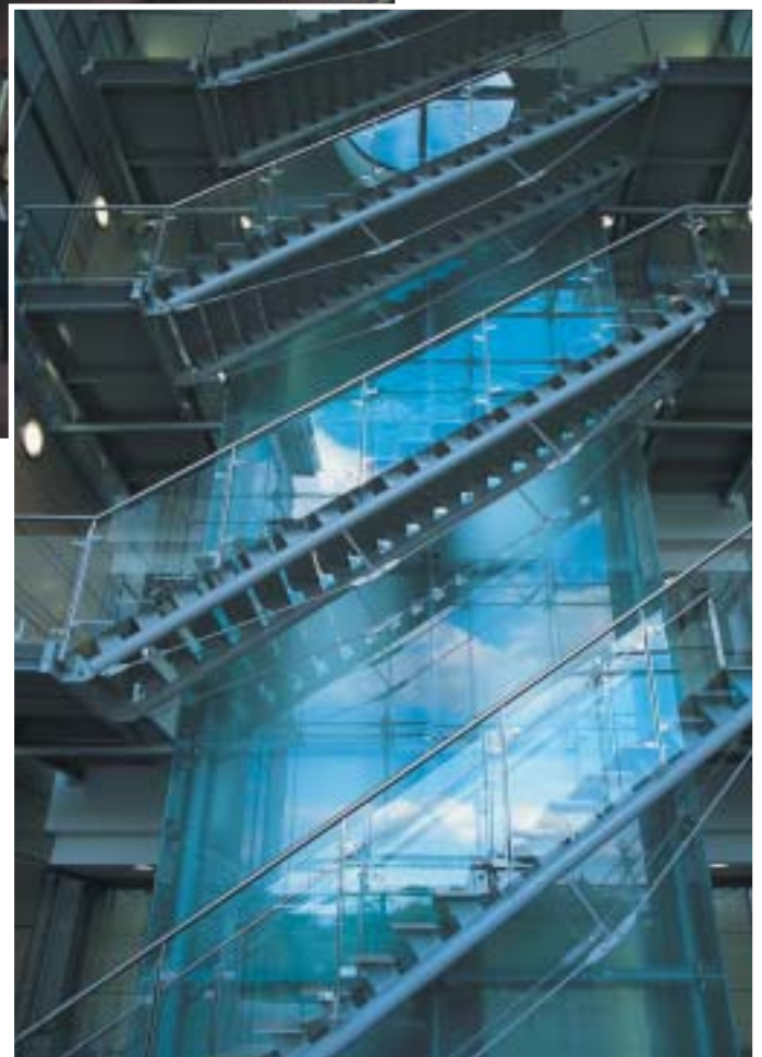
Four flight staircase complete with glass balustrading and timber treads and landings.