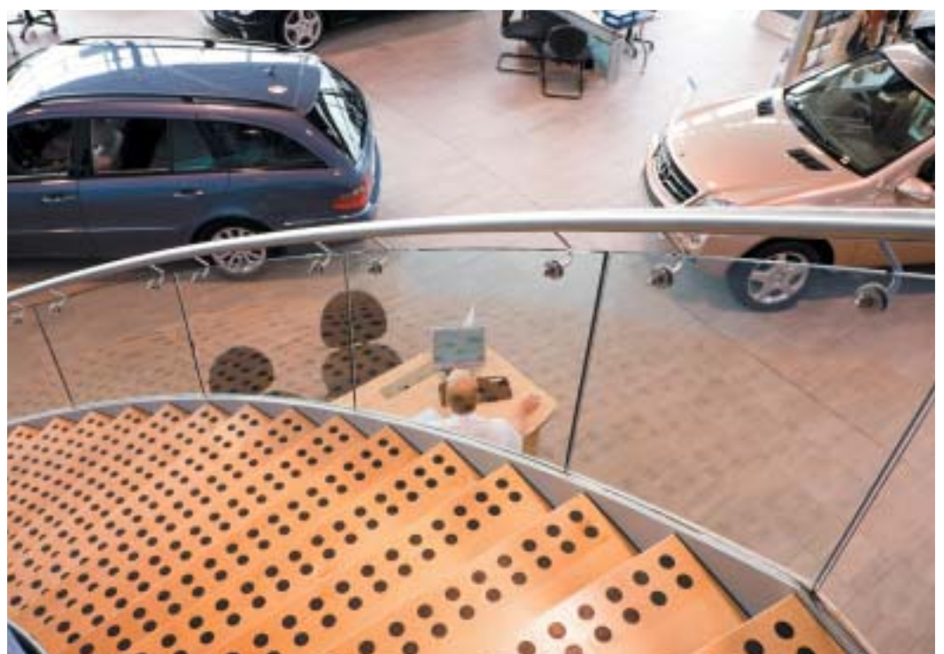
Mild steel helical staircase complete with structural glass balustrade, stainless steel top and wall rail and timber treads. Project: Mercedes Poole