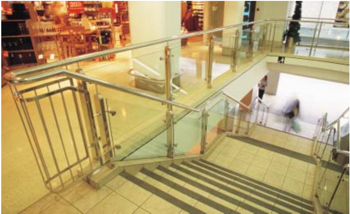
Stainless steel glass infilled balustrading to shopping centre stairwell and balcony.