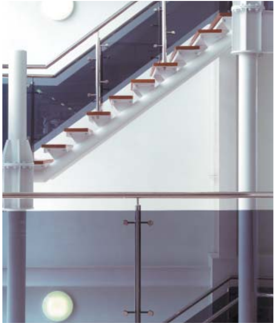
Staircase with spine stringers.