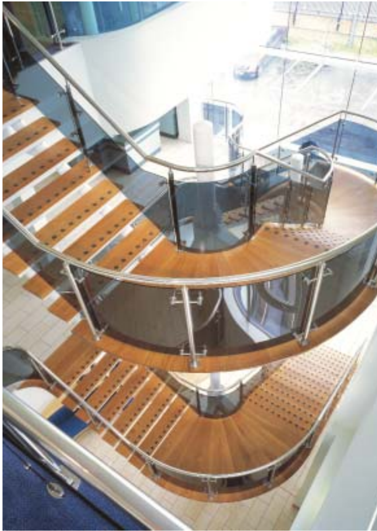
Curved glass complements the balustrading on this feature staircase at Searchlight Electric in Manchester.