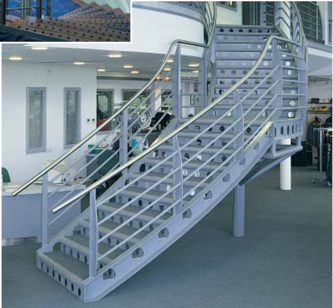
Helical staircase with mild steel support steelwork, balustrading and stainless steel top rail.