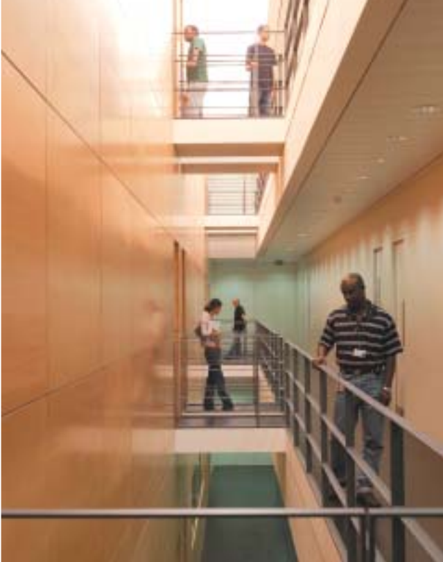
Flat bar balustrade.