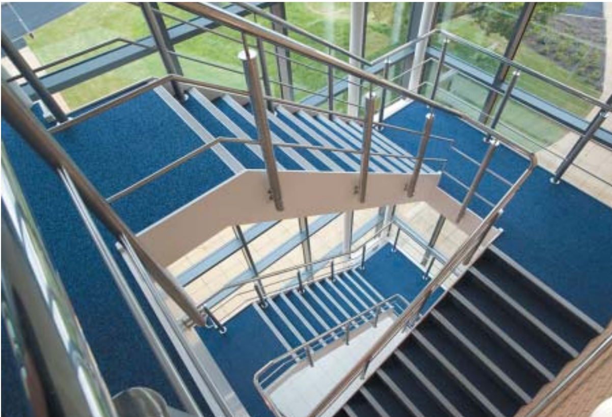
Staircase complete with stainless steel balustrading.