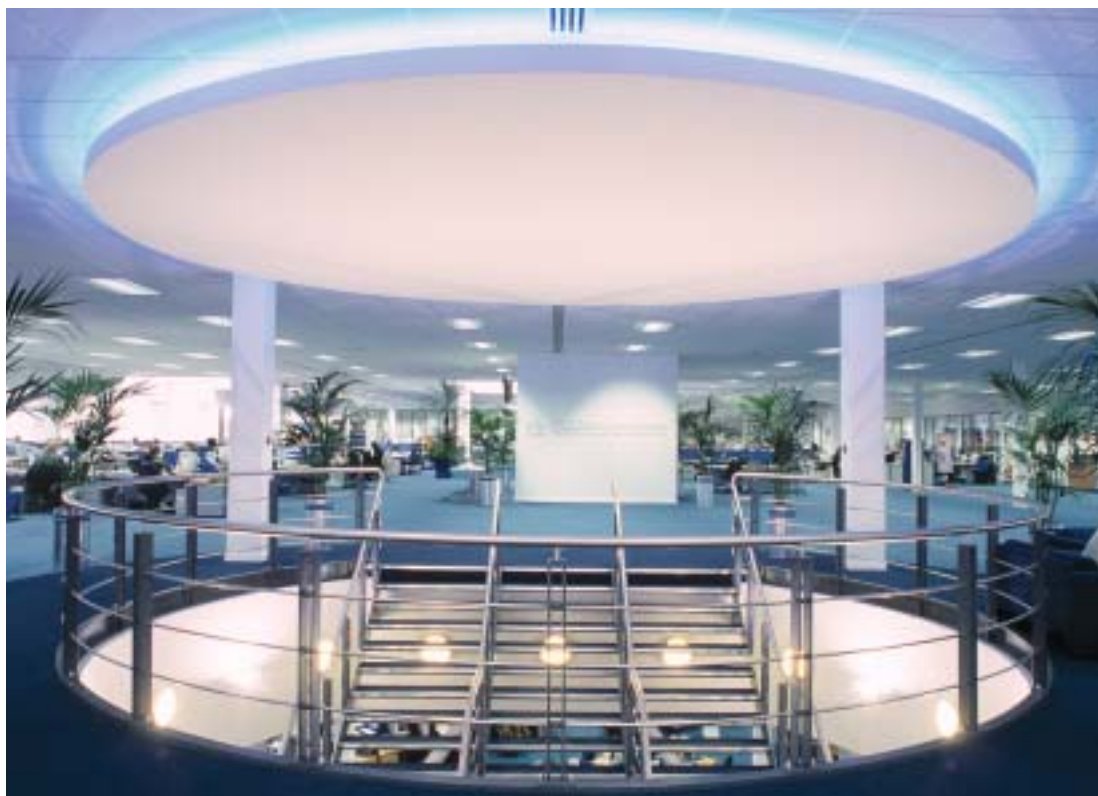
Mild steel polyester coated balusters complete with stainless steel rod infills and top rail.