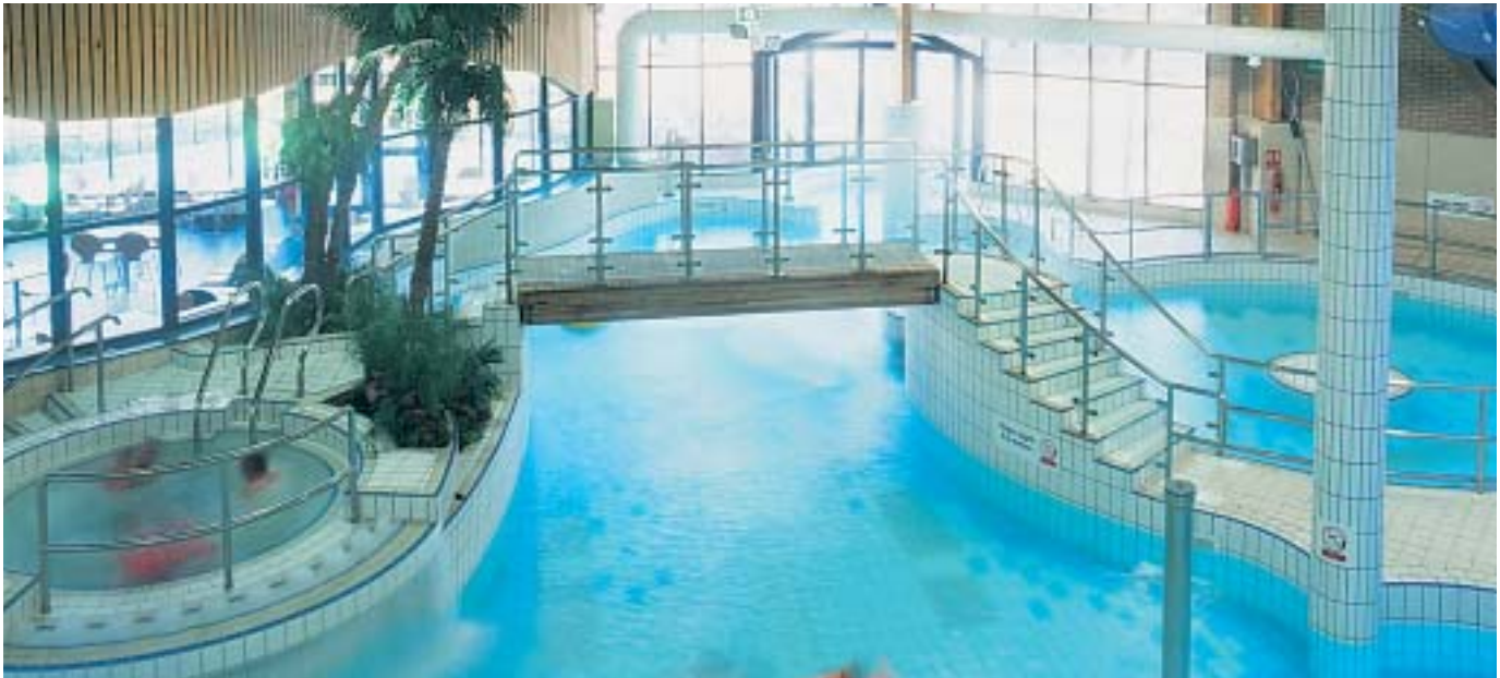
Stainless steel balustrading complete with toughened glass panels. Stainless steel twin rail barriers and spa pool access ladders.

M & G Olympic Products are a major supplier of standard and specially designed swimming pool equipment for new and refurbished projects, including hydrotherapy pools.