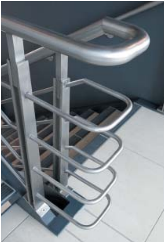
Stainless steel balustrading with twin leg balusters.