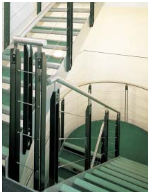
Mild steel polyester powder coated balusters complete with stainless steel top rail and wire infill. Project: Eddie Stobbart.

Staircases and their associate balustrades can be designed and manufactured in many configurations including straight, spiral or curved with infills of toughened glass, timber, sheet, bar or perforated plate. Top rails can be of mild or stainless steel, timber or nylon coated.