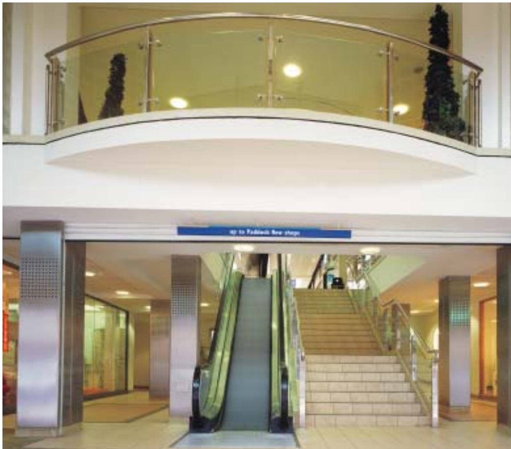
Stainless steel glass infilled balustrade to balcony edge.