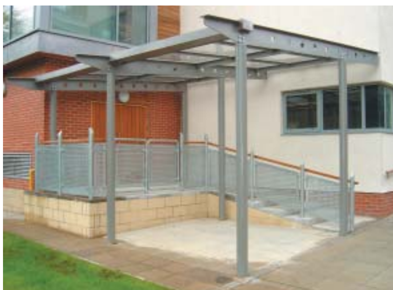
Canopy and galvanised external balustrading with a timber top rail and mesh infill panels.