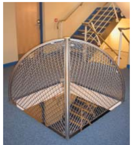
Stainless steel light-well dome complete with 6mm fabricated mesh infill.