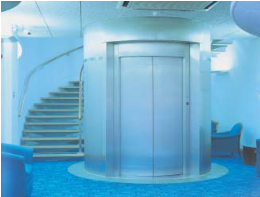
Stainless steel lift shaft cladding.