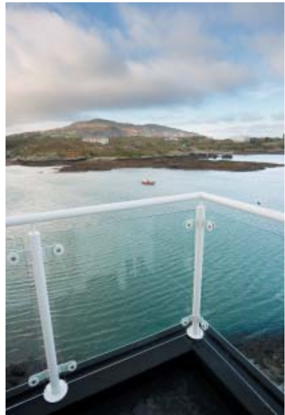
Polyester powder coated balcony balustrade with glass infill.