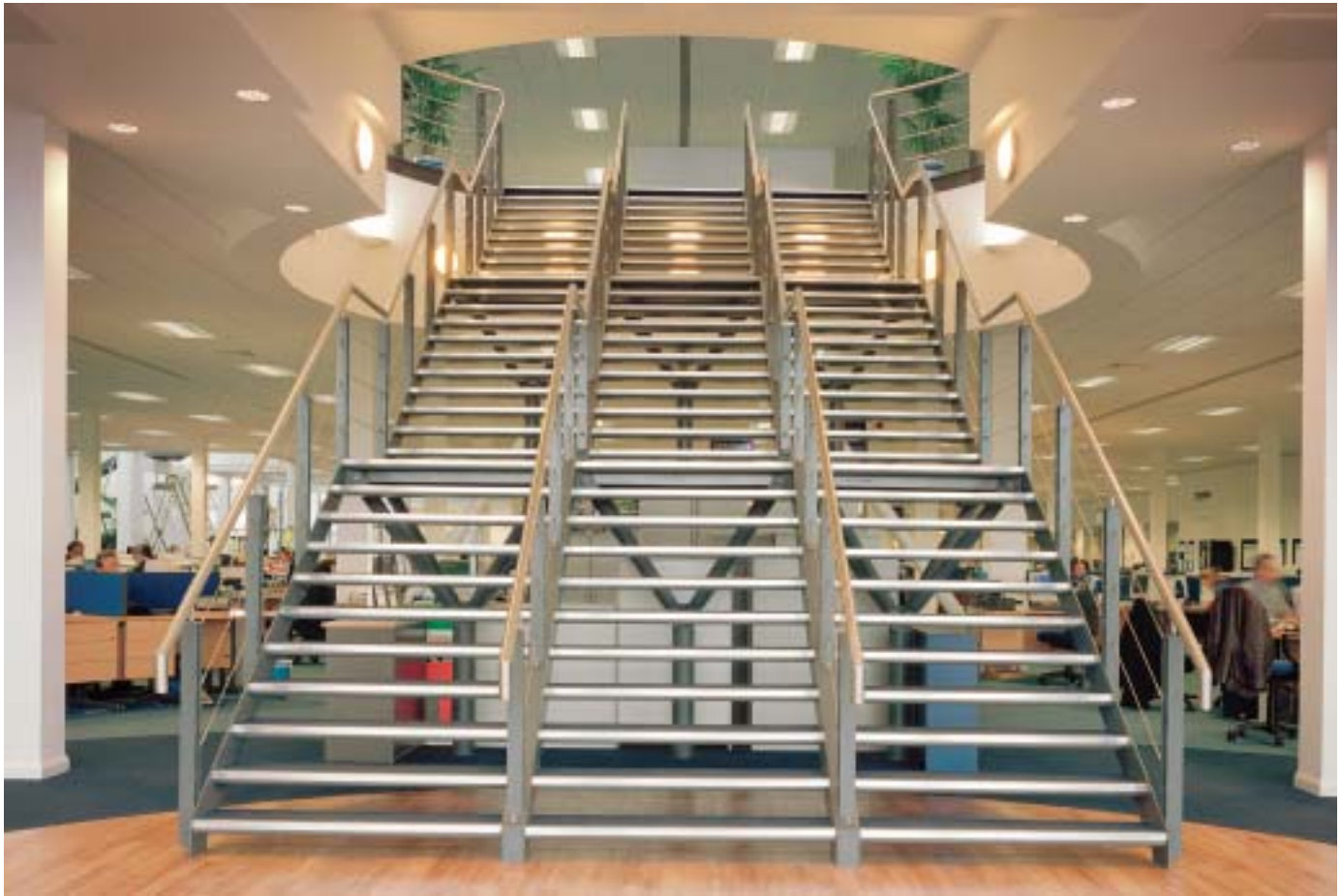
Mild steel powder coated feature staircase and balustrading. The balustrading has a stainless steel top rail and three stainless steel wire infills.

Although normally manufactured from polished stainless steel, balustrades and hand rails can also be supplied in mild steel, galvanised or polyester powder coated mild steel, or polished brass.