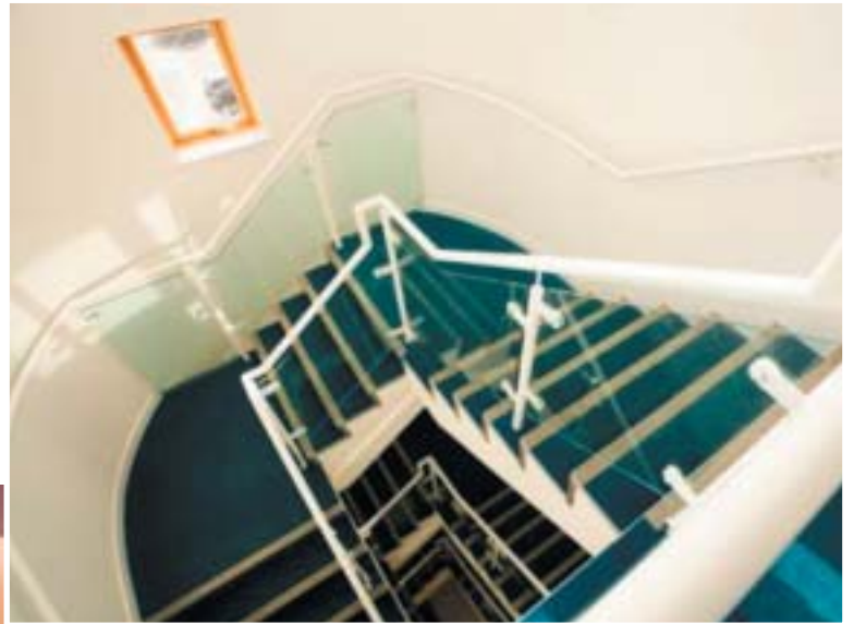
Polyester powder coated glass infill balustrading Project: Holyhead Marina