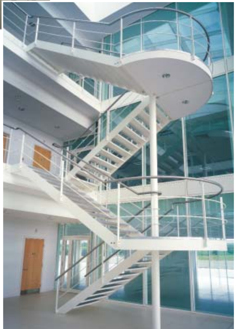
Four flight staircase provides the feature to this open area.