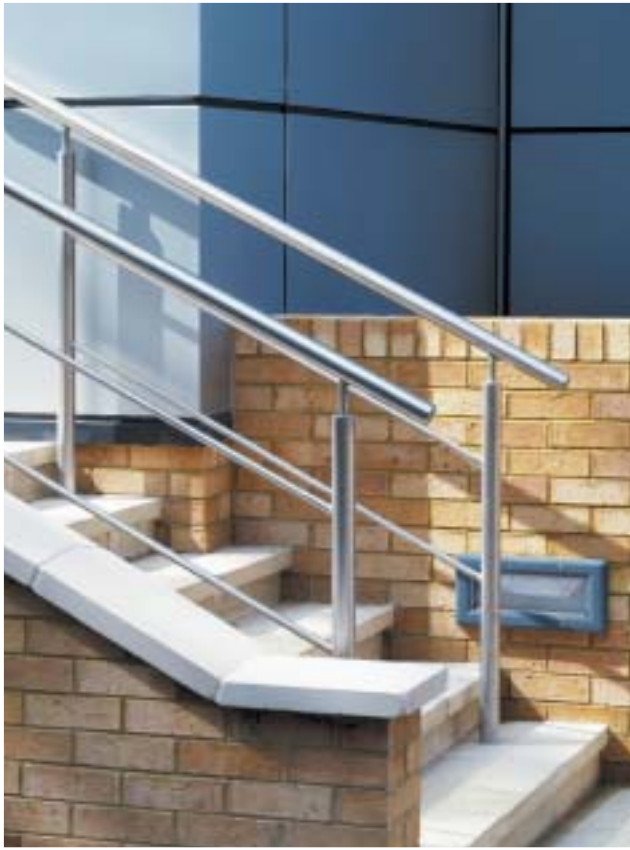
Stainless steel balustrade to external steps.