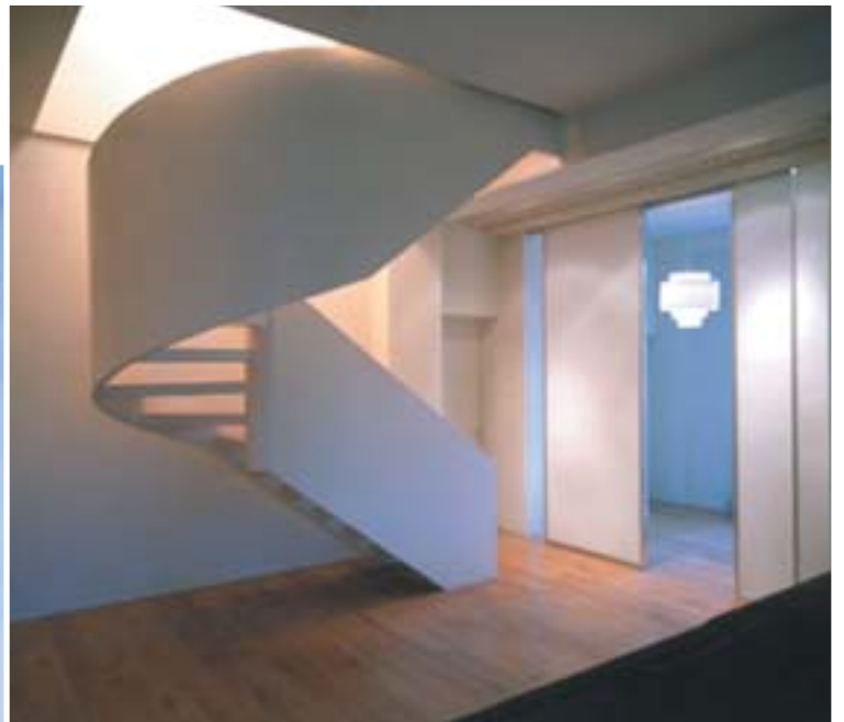
Mild steel staircase complete mild steel sheet-clad balustrade for Quinn Architects