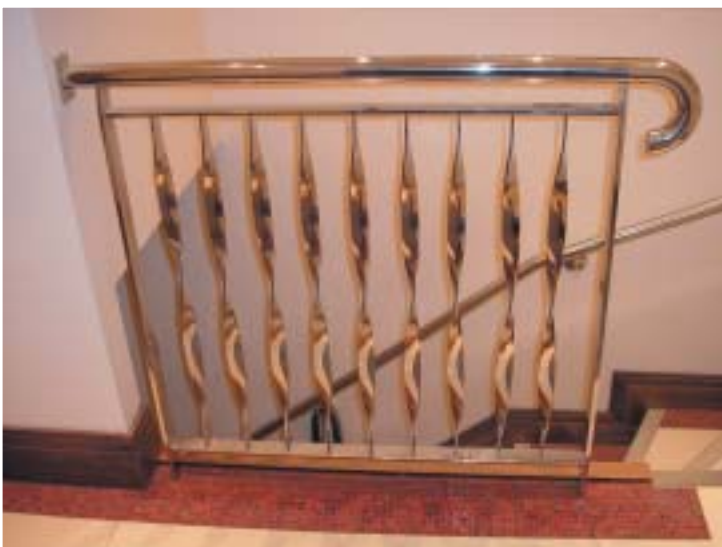
Stainless steel balustrading with a flat bar twist infill. Project: Nightclub, London.