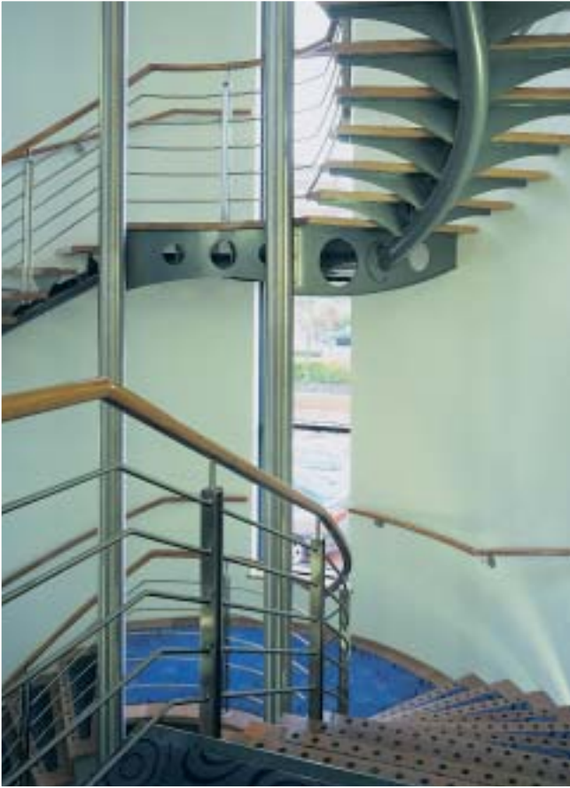
Mild steel polyester powder coated helical staircase and stainless steel balustrading complete with stainless steel support columns, timber treads and top rail. Situated in the prestigious offices of a surgical instruments manufacturer.