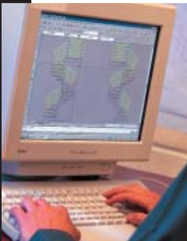
Design solutions to any specification.

For further details on these or any of our products in our portfolio, please contact us at sales@mgolympic.co.uk , call 0114 275 6009, or log onto our website: www.mgolympic.co.uk .