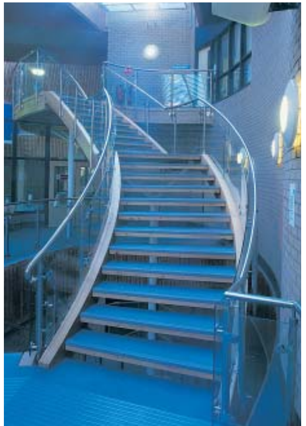
Stainless steel curved balustrading with curved toughened glass infills complete this staircase perfectly at The Quays Swimming & Diving Centre in Southampton.