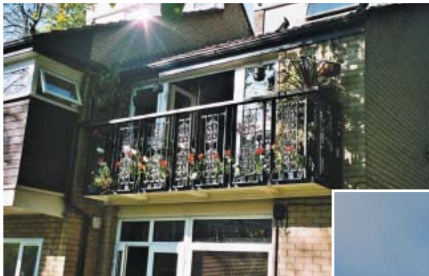
A typical domestic balcony.