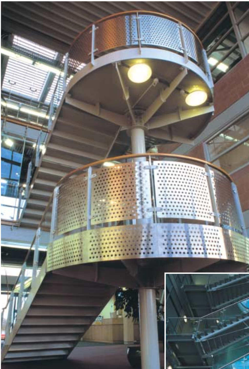
Mild steel staircase landings, support column complete with glass and stainless steel perforated sheet infilled balustrading and timber top rail.