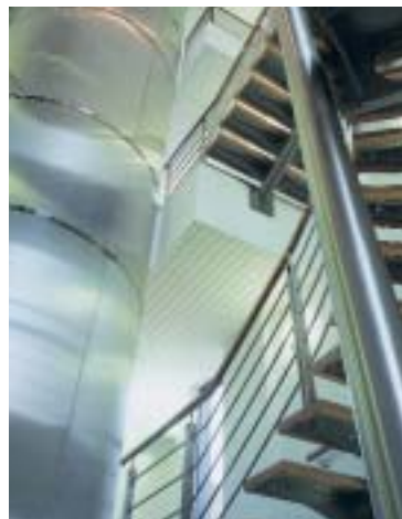
One of our projects.