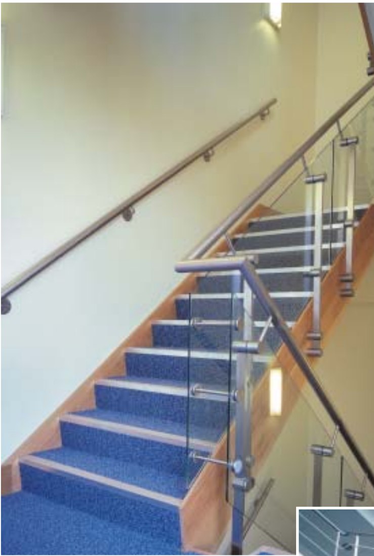
Mild steel staircase clad in timber (by others) complete with glass infilled balustrade.