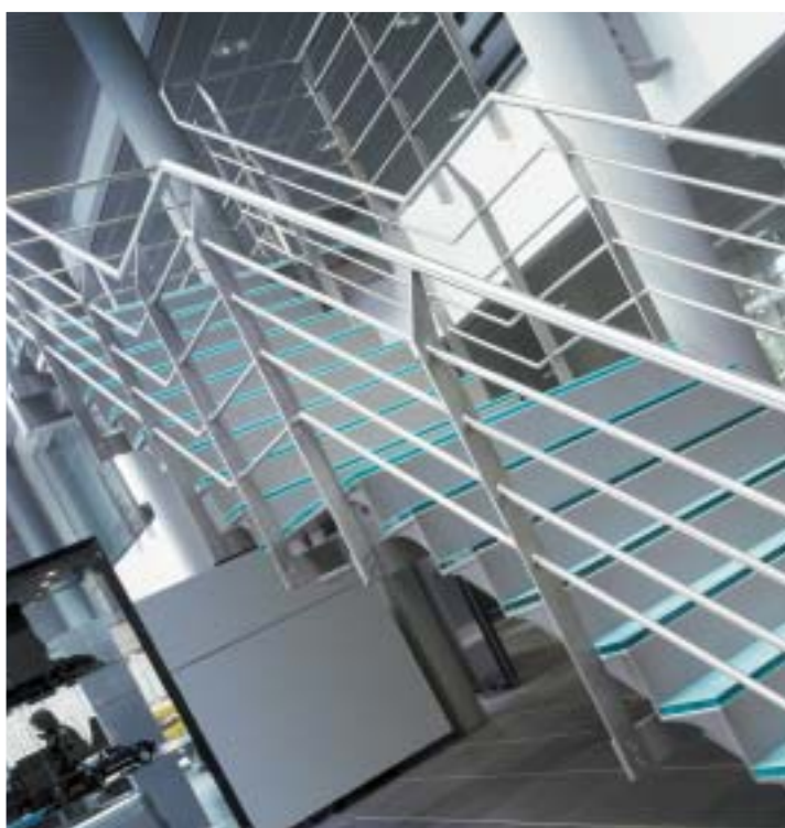
Glass treads complement this staircase in a prestigious car showroom.