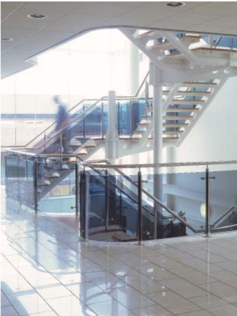
Polyester powder coated staircase complete with glass infill balustrade. Project: Searchlight, Manchester