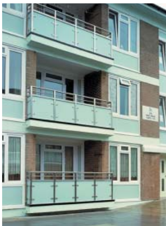
Stainless steel with coloured perspex infill panels.