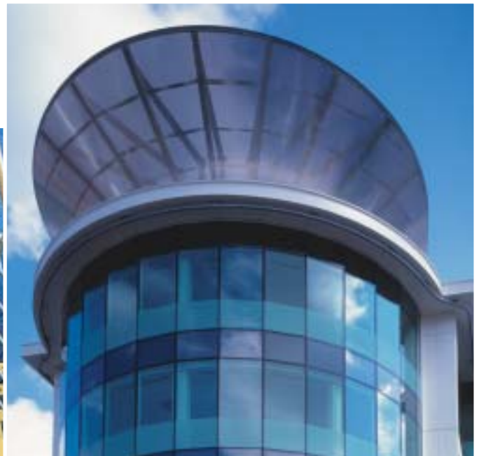
Structural steel framework with a perforated sheet cladding form an impressive feature to this office block roof.