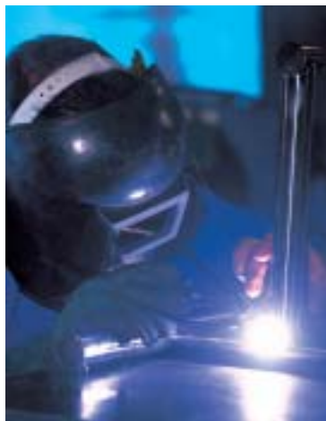
State-of-the-art production technology.