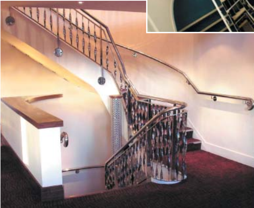
Stainless steel balustrading complete with a flat bar twist infill. Project: Nightclub, London.