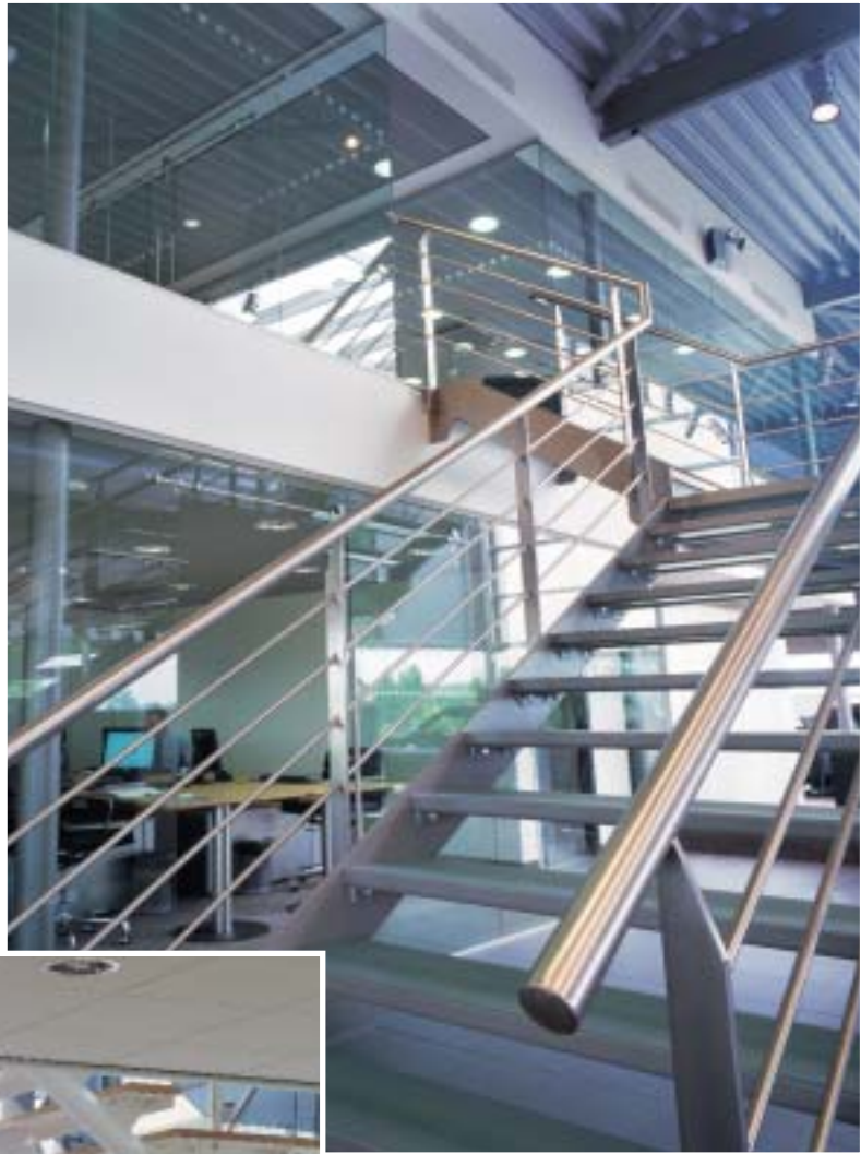
The glass infilled tray type treads complement this staircase.