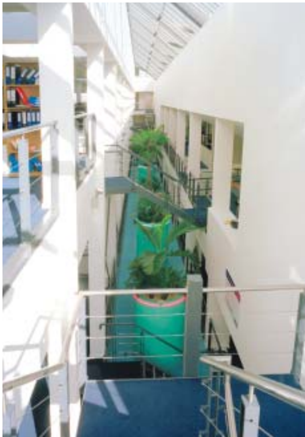
Powder coated mild steel balustrade complete with wire rope infill and stainless steel top rail, complement the atrium staircases.