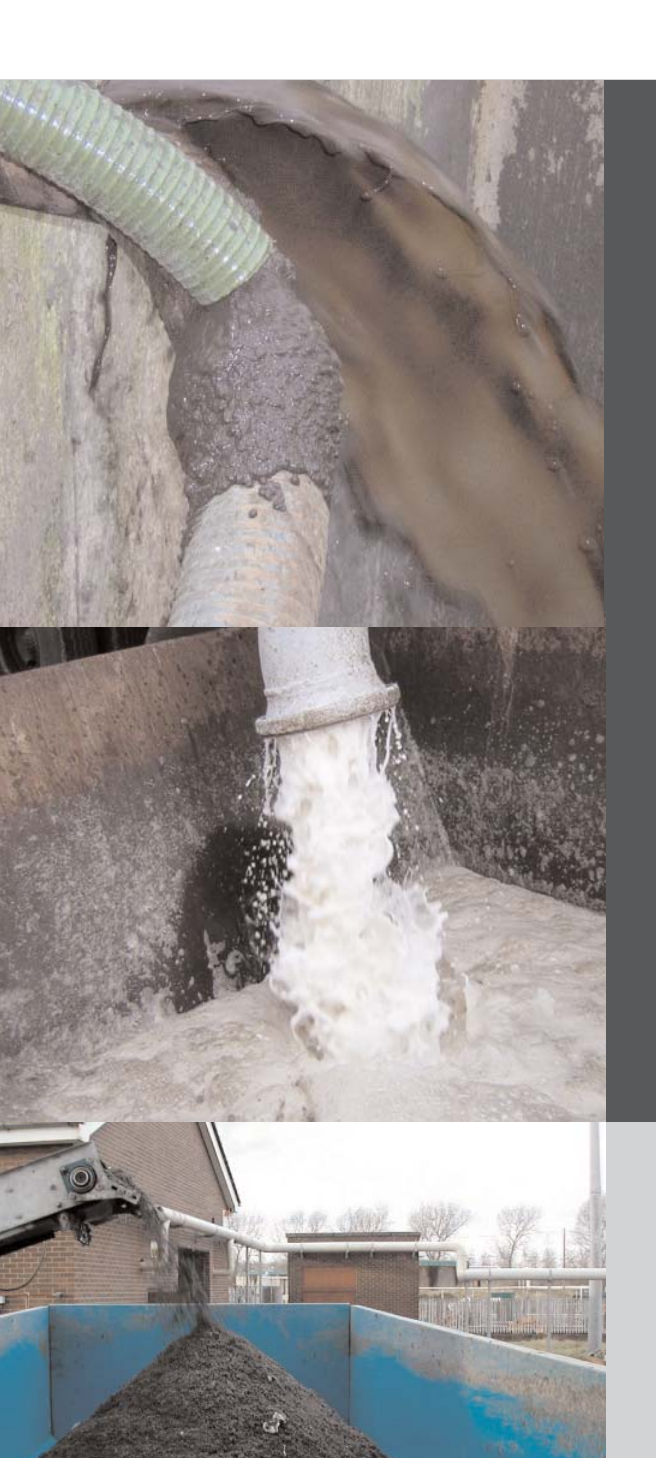
Dewatering of waste water treatment sludges.

Centrifuges are used globally for the high performance separation and dewatering of suspesions in industries ranging from food production to waste water treatment. The current range available offers models from 1 – 150m3/hr. Hygienic designs are available for food and pharmaceutical production, and other specialist three phase models are used for the separation of oil from water and solids. Custom built, complete turnkey project installations are available from M&SE to meet your particular site requirements.