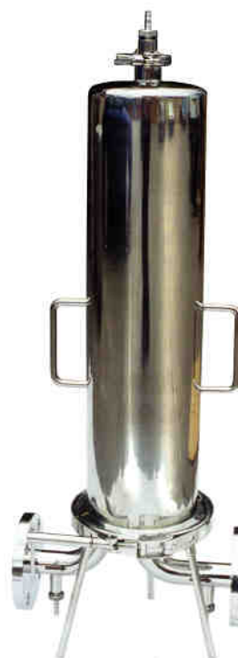
LC 3X500 SS HYGIENIC