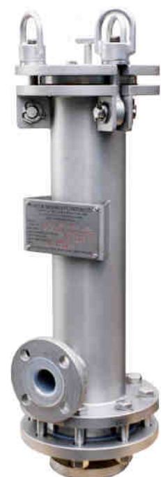
LC 1X250 SS FEP LINED