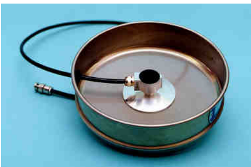
SCREEN fitted with ULTRASONIC VIBRATOR