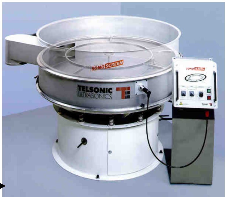
SCREENING MACHINE FITTED WITH TELSONIC® ULTRASONIC VIBRATOR