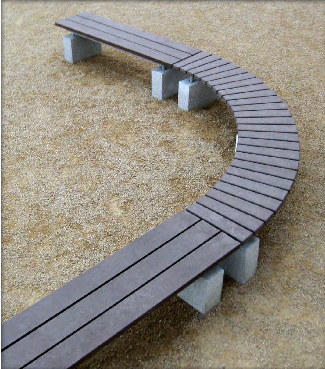
SBN307/D-GG/RP-BR/GL (WITH SBN310)