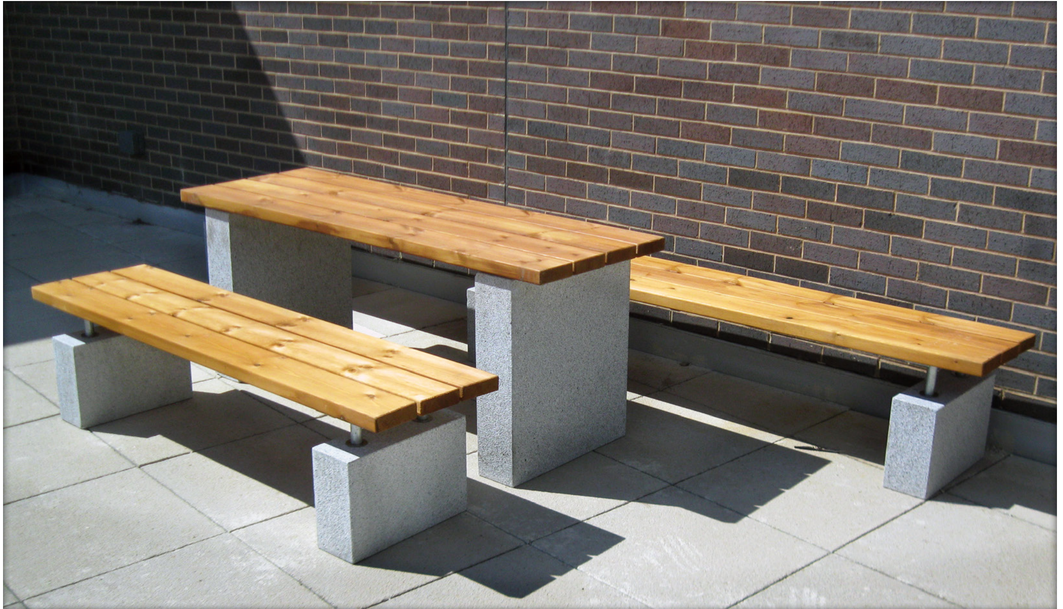
SPT311/D-GG/TRC3-DO/GL WITH SBN304 & SBN304-2500/D-GG/TRC3-DO/GL